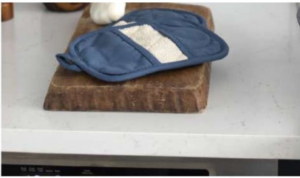
RITZ ® Royale RITZ ® Mitz