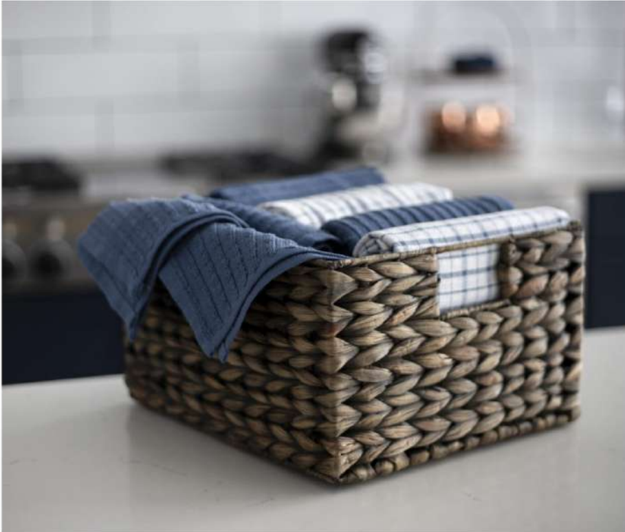
RITZ ® Solid Kitchen Towels, RITZ ® Royale Coordinate Kitchen Towels and RITZ ® Royale Solid Dish Cloths

The RITZ ® Royale Terry Pocket Mitt and the RITZ ® Royale Terry Pot Holder are made of 100% terry cotton to provide an extra layer of heat protection when you are handling hot pots, pans and dishes. The RITZ ® Royale Terry Pocket Mitt has a special pocket for your hand to slip into to protect it from heat. It comfortably fits any adult size hand. The RITZ ® Royale Terry Pocket Mitt's versatile 3-in-1 use allows it to work as a pocket mitt to protect your hands, a hot pad and also a pot holder to protect your countertops when placing hot pots and pans on them. The RITZ ® Royale Terry Pot Holder provides a versatile 2-in-1 use since it works when used as both a pot holder and a hot pad. Both the terry mitt and terry pot holder are machine washable.