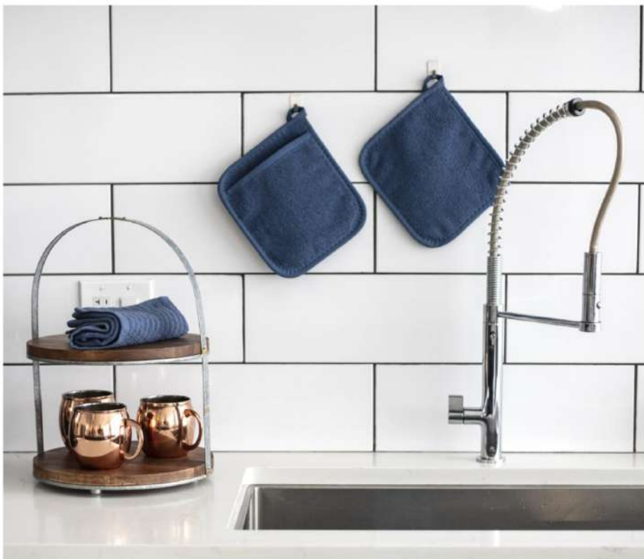
RITZ ® Royale Terry Pocket Mitt and the RITZ ® Royale Terry Pot Holder

The RITZ ® Royale Solid Apron is a universal size that is designed to fit both men and women. It features an adjustable neck strap and ties at the waist so that it will fit anyone comfortably. Since it is machine washable, you can rest assured that you will always have a clean apron ready to wear.