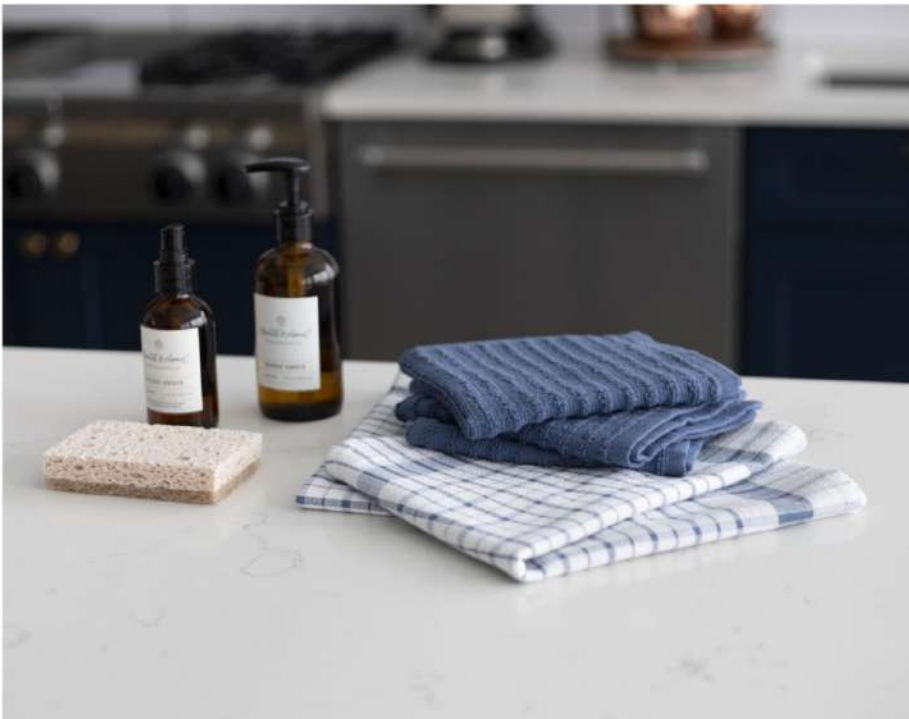
RITZ® Wonder Towel

The RITZ® Royale line has everything you need for your daily kitchen needs for cooking, cleaning and entertaining. Royale products make great gifts for cooking enthusiasts, people who love to entertain, housewarming party gifts, hostess gifts, holiday gifts and more. Keep reading to learn more about our RITZ® Royale kitchen products and watch the videos of Chef Billy Parisi demonstrating their use.