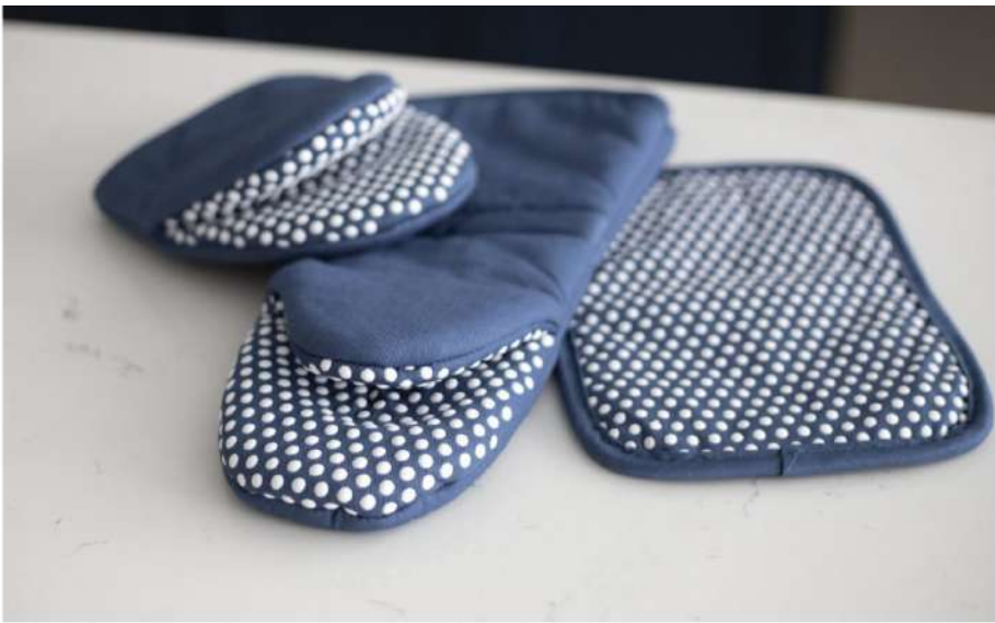
RITZ® Royale Silicone Grabber Mitt, RITZ® Royale Silicone Oven Mitt and the RITZ® Royale Silicone Pot Holder