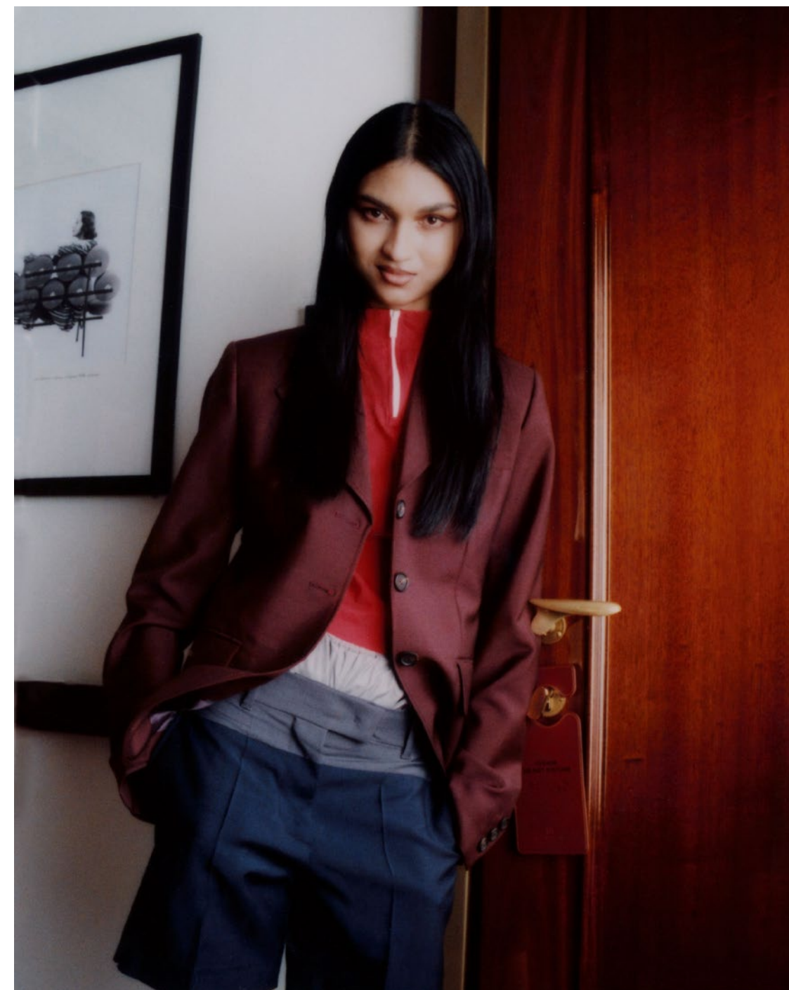
opposite full look. Miu Miu full look. Miu Miu