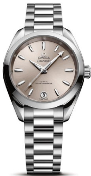
SEAMASTER AQUA TERRA SHADES Co-Axial Master Chronometer