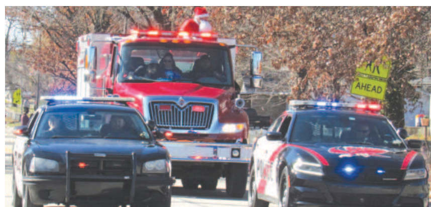
Santa gets a special escort while riding a Fairland Fire Department truck