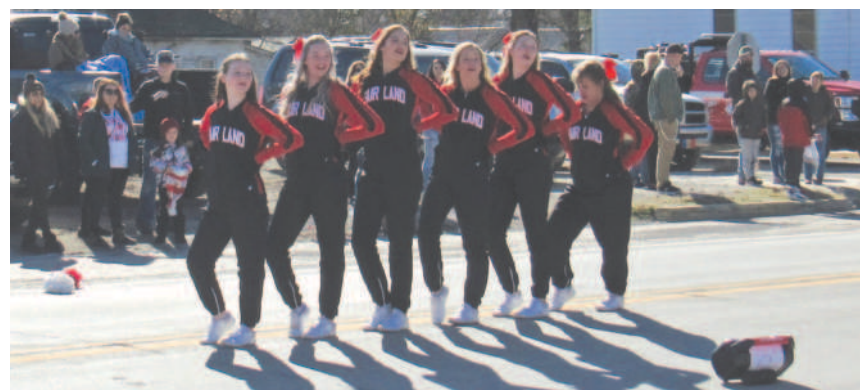
The Fairland High School cheerleaders performed at Saturday's parade.

The squad was nestled between the Fairland High School and Quapaw High School marching bands, who both added their own music to the festivities with versions of classic Christmas tunes that jingled all the way down Highway 60.