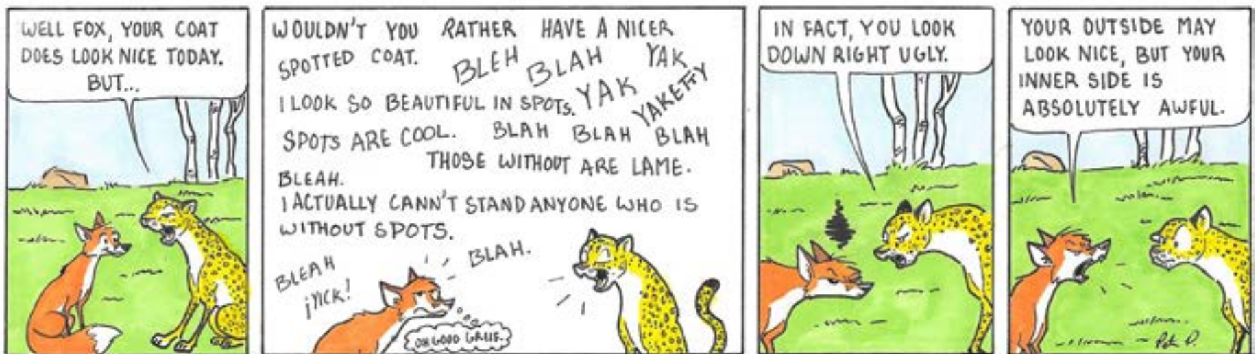
Comic submitted by Peter Pustejovsky

People have gradually become more accepting of each other's differences. We're more connected with others than ever before, and yet our fairy god-intern questions: "Why doesn't anybody tuck anything in anymore?"