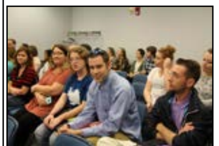
The final event of the day was the first ever awards for "Best of Show"