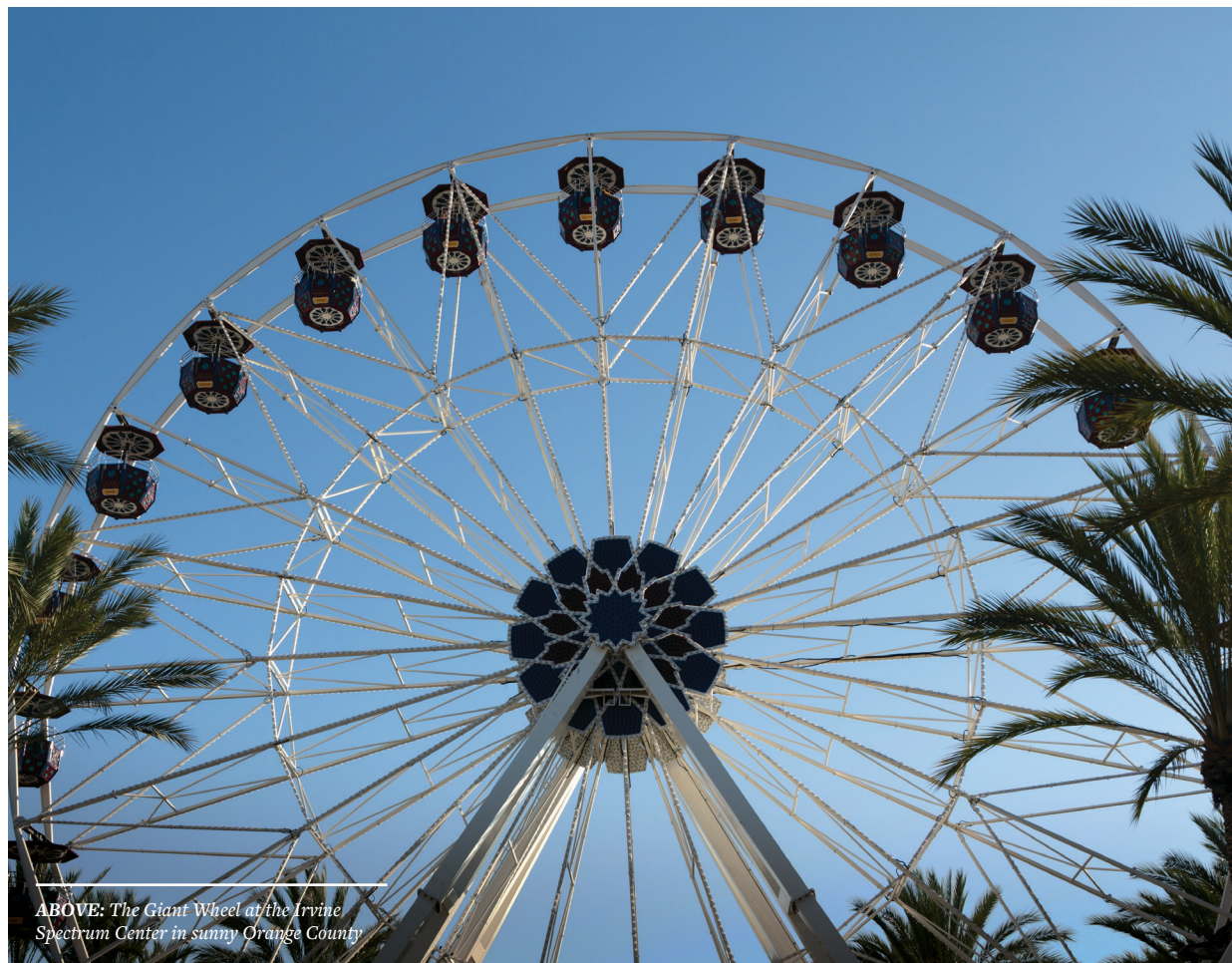
ABOVE: The Giant Wheel at the Irvine Spectrum Center in sunny Orange County