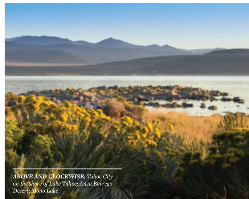
ABOVE AND CLOCKWISE: Tahoe City on the shore of Lake Tahoe; Anza Borrego Desert; Mono Lake

underrated destination for vino. The quaint town of Murphy's has its own Under-the-Radar Wine Tasting where you can explore the wineries and their beautiful tasting rooms that give this part of the Golden State its own unique flavour. For a special place to stay, check out Querencia, a secret-hideaway-style inn overlooking vineyards and the Sierra foothills.