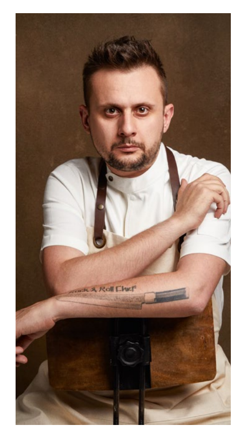
Turks are asking me where I've been? They say they've missed me!

Tradition and heritage are the pillars of Anatolian restaurant Sade, famous for its indulgent breakfasts and brunches that showcase some of Turkey's lesser-known dishes. Greek and Middle Eastern influences abound on a table groaning with the familiar – meat, cheese, olives, eggs, tomatoes, cucumbers – and, on