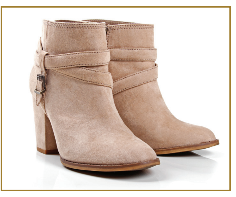
Strappy Micro Suede Western Booties by Five Senses Designer <del>Orig. Price: $119.00</del> Sale Price: $83.00