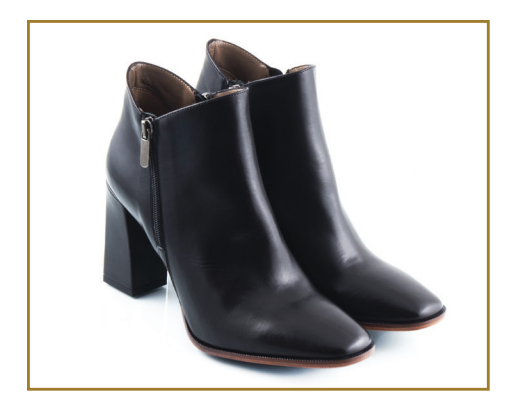
Black Leather Block Heel Booties by Lux Max Designer <del>Orig. Price: $130.00</del> Sale Price: $91.00