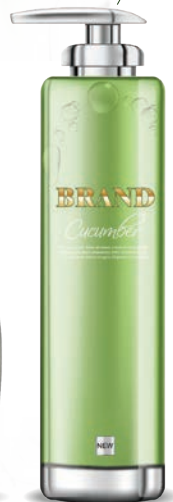
Cucumber Renewal Cleanser 12 oz