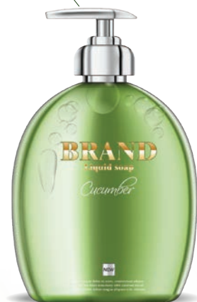
Cucumber Renewal Moisturizer 8 oz