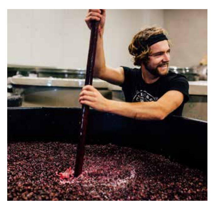
TOP / The North Canterbury Wine Food Festival is held annually in March in the Glenmark Domain and showcases some of the regions best wine, beer and artisan foodies. This year the 'coolest little wine festival' is on Sunday 10 March. ABOVE / Harvest time at Greystone Wines in the Teviotdale Hills.

We can't make up our mind what to do after lunch. My daughter wants to ride the Weka Pass Railway. This adorable vintage steam train run by volunteers, puffs between Glenmark and Waikari, and it's the perfect post-lunch adventure. I'm muttering about cycling part of the Waipara Valley Vineyard Trail with its spectacular mountain views and cellar doors, but if truth be told, that will probably prove far too energetic and I'll settle for a gentle stroll instead. My partner loves driving through the rolling hills and likes to press on to the aptly named Mt. Beautiful Wines and their tasting rooms in Cheviot. My parents like to visit Gore Bay and its baroque clay Cathedral Cliffs like a natural Sagrada Família. My sister is a wildlife tour guide and fancies a trip to St Anne's Lagoon