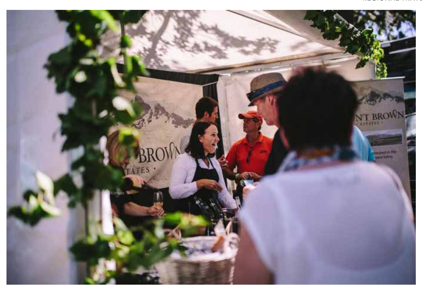
We can't do it all, but the beauty of North Canterbury is that it's just on our doorstep, so we'll toss a coin, and come back another day for more.

barman would attest, we're quite familiar with their spicy plummy Iridium, made from some of the oldest Cabernet vines in the country, and we like it so much, we're keen to try their other varietals. Then it's on to Black Estate for some lunch, because that picnic in Amberley was hours ago. If there's a finer spot to sip a glass of Chenin Blanc and eat delicious local food while gazing out over the vines, we haven't yet found it.