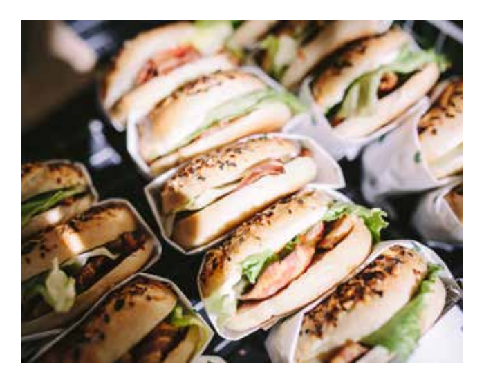
TOP / Food writers, chefs and international wine writers spend a day foraging, fishing and gathering in North Canterbury at Forage North Canterbury. ABOVE LEFT/ A couple tasting wines at Bell Hill in Weka Pass (open by appointment). ABOVE / Filled Grizzly Bagels await the crowds at the North Canterbury Food and Wine Festival.

By then it'll be mid-afternoon, so we'll head home via a pot of tea and a wodge of cake at Pukeko Junction. Or maybe we won't go home. Maybe we'll turn off at Glenmark and head inland to Hanmer Springs, for some evening relaxation in the hot pools, an overnight stay in an alpine lodge and another glass of sublime local wine. We can't do it all, but the beauty of North Canterbury is that it's just on our doorstep, so we'll toss a coin, and come back another day for more. For more information about North Canterbury Wine Region visit northcanterburywines.co.nz. To plan your visit to North Can terbury, check \ out \ visithur unui. co.nz \ and \ alpine pacific.nz