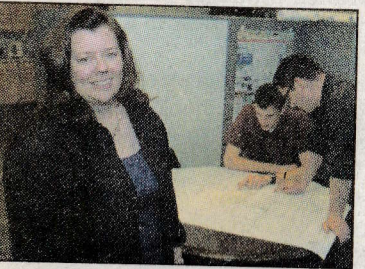
Engineering Design Consultants growing, sees additional opportunities. — Page 4