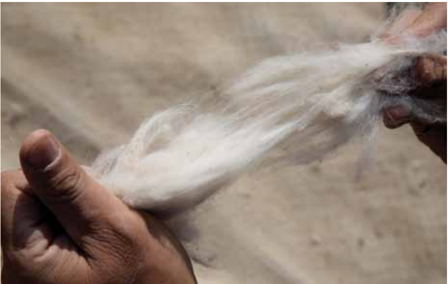
The fine, soft fibres of baby cashmere