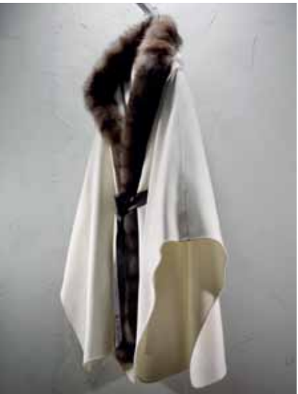
A cape in Loro Piana Baby Cashmere®