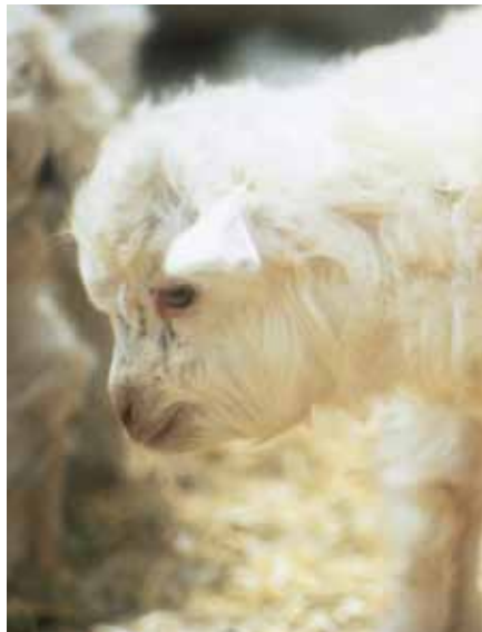
A Mongolian Hyrcus kid

Loro Piana is recognised by the most discerning customers in the world for creating a complete range of lifestyle products. Manufactured with the finest raw materials, they are crafted to perfection in Italy, following classical codes of Italian elegance. With 136 stores to its name located in the world's most iconic cities, from Paris, London and New York to the fast-paced metropolises of the East – Shanghai, Beijing and Hong Kong – Loro Piana stands for six generations of expertise, family tradition, and the unending pursuit of excellence.