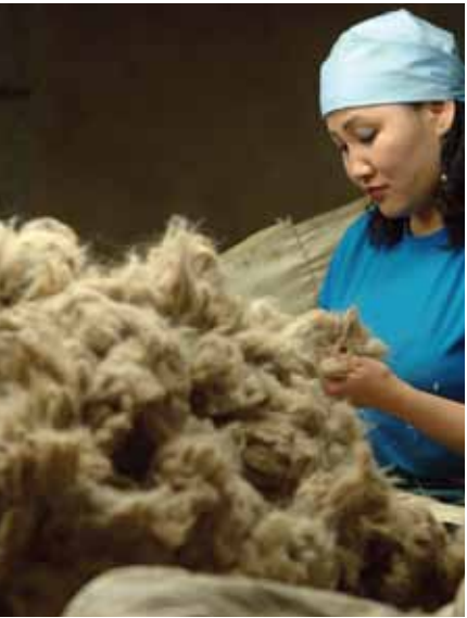
Cashmere fleece being meticulously examined

As the trucks rumble off and the grittily romantic landscape recedes hazily into the distance, signposts are already pointing the way to the highest hurdle of the Loro Piana journey: the rigorous quality tests that each sack of fibre must undergo in its laboratories. On arrival, the fleece is scoured, washed and dried before the fine cashmere fibres are liberated from any coarse outer hairs, and examined to determine if their early promise meets the exacting technical standards. And though its eventual destination is unknown – Loro Piana Baby Cashmere® may be crafted into a unique cape, a timeless cable-knit sweater or a sumptuous gift – Loro Piana will continue to strive to bring out its exceptional potential.