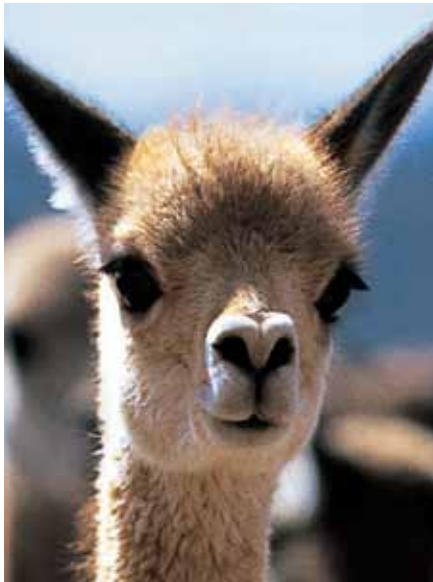
A Peruvian Vicuña

Beloved by discerning customers around the world, Loro Piana is the creator of a comprehensive range of lifestyle goods. Manufactured using the finest raw materials and drawing on a classical Italian heritage, products are crafted to perfection in Italy. With more than 130 stores spanning the globe from the fashion capitals Paris, London and New York to energetic emerging cities like Shanghai, Beijing and Hong Kong, Loro Piana combines six generations of textile expertise and family tradition with its unique philosophy of striving for excellence.