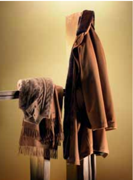
Loro Piana Icer Coat, knitwear and scarf made from Vicuña fibre