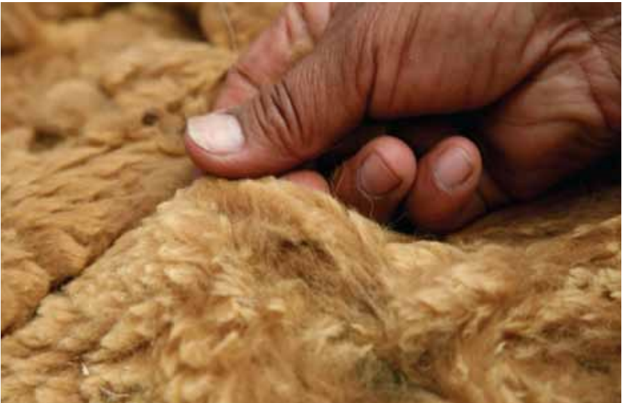
The fine Vicuña fibre being meticulously examined