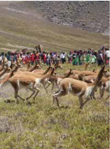
Chakku, a time-honored ceremony to gather Vicuña fibre

Through special dyes that maintain the fibre's incredible softness and the pioneering Storm System® treatment to render the fabric wind and waterproof, Loro Piana has harnessed Vicuña's extraordinary potential in its diverse range of lifestyle goods. From sumptuous knitwear to outerwear, accessories, robes and blankets as well as an exclusive bespoke service, Loro Piana's Vicuña caters to the most discerning consumers the world over looking for unequalled quality.