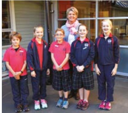
Paparoa Street Primary School students held a successful pyjama day on June 10, to coincide with our National Street Appeal. Pictured here is their school council visiting the House to present their generous donation.