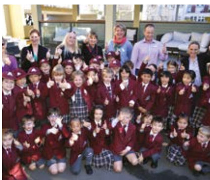
Cathedral Grammar students held a bake sale to raise money for our Christchurch facilities. The junior school students loved visiting the House to present their cheque and learn more about the families we serve.

"This type of learning is really exciting for students and teachers and is becoming increasingly popular with schools."