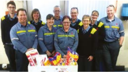
The Analytical and Monitoring team from New Zealand's Aluminium Smelter regularly donate household items to the Family Room, Southland Hospital.

The latest happenings from the Ronald McDonald Family Room, Southland Hospital