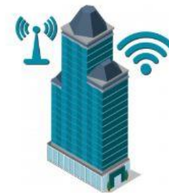
Strengthening the Infrastructure