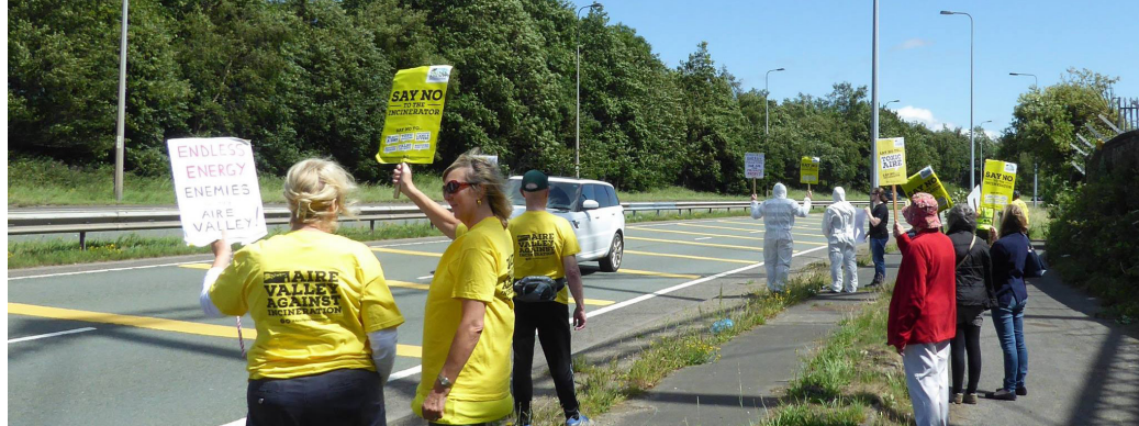
▶ TOXIC AIRE: Members of Aire Valley Against Incineration protesting outside the proposed incinerator site in Marley

Aire Valley Against Incineration (AVAI) have announced a last call for residents to submit their rejection of the building of a waste incinerator.