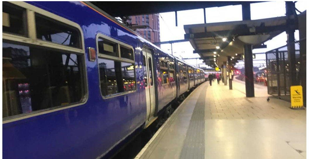
▲ OUT OF DATE: Northern customers have also been unhappy with the old, rundown quality of many Northern trains