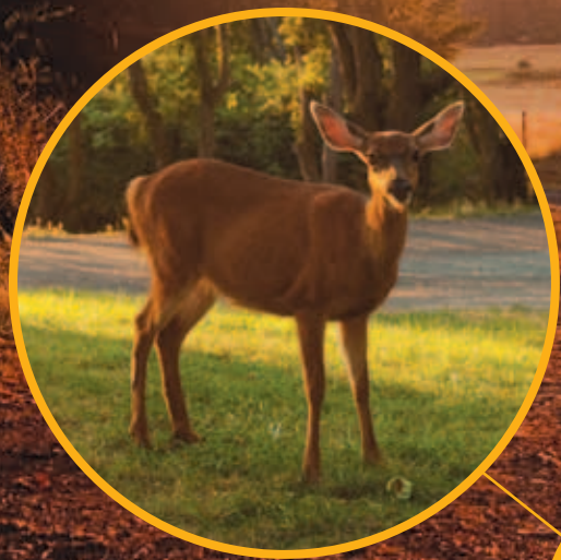
FUN FACT! Resident deer freely roam Camp Orkila