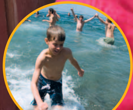
Polar bear swim