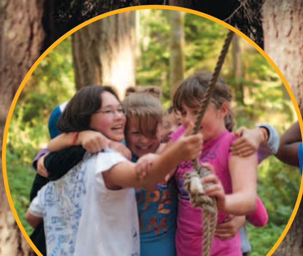
The low ropes foster team building and cabin group bonding.