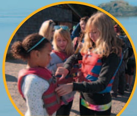
Life preserver check