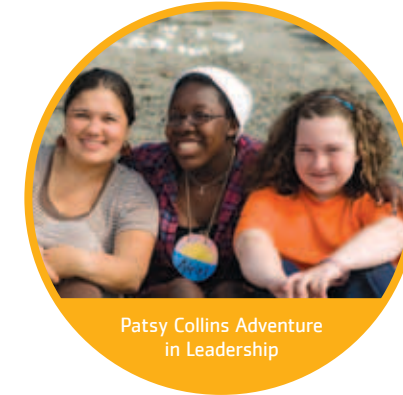
Patsy Collins Adventure in Leadership

"PCAL" is a two-week experience at Camp Orkila that empowers girls with the self-confidence to lead, the spirit to give back to their communities and a personal awareness to live a healthy and balanced life. Girls learn to use their multicultural leadership skills, hear from inspirational speakers and take part in group building activities that challenge stereotypes about what it means to be a girl today.