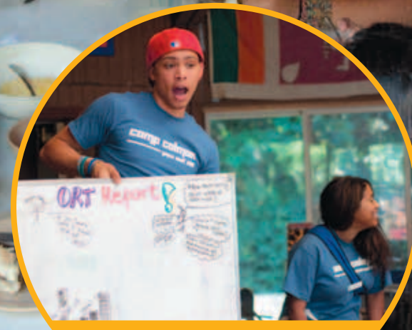
Camp staff teach kids why conserving and recycling are important.