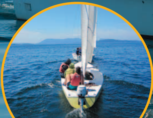
Expeditions away from camp include sailing, biking, or kayaking.