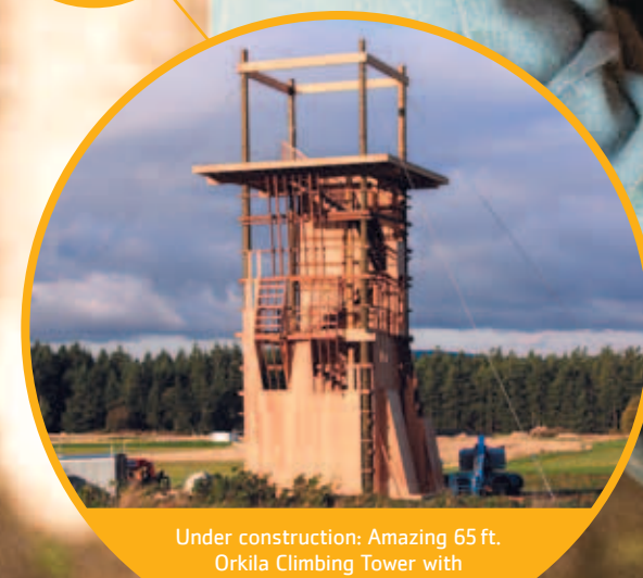
Under construction: Amazing 65 ft. Orkila Climbing Tower with 1000 ft. dual zipline.

! "Our son loved everything about camp! He can't wait to go back next year – for even longer."