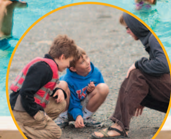
Campers explore the nearby beach with their counselor.