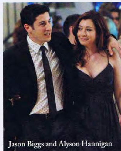
Jason Biggs and Alyson Hannigan

In an interview with Complex Magazine , Thomas confessed he had doubts at first when coming back to the set. "At first I think it was a little awkward because it was like this is the moment that everyone's asked us about and it's going to be talked about and here we are. It really didn't take long before we were all hitting each other in the balls and making fart jokes and just reverting to the way we were acting when we were 17 years old. If there's any place you have a license to act like an immature, adolescent boy, it's on the set of American Pie . So we all just took that and ran with it."