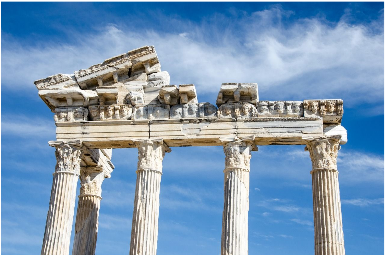
The Temple of Apollo in Greece is one of thousands of ancient sites constructed for Solar Deities