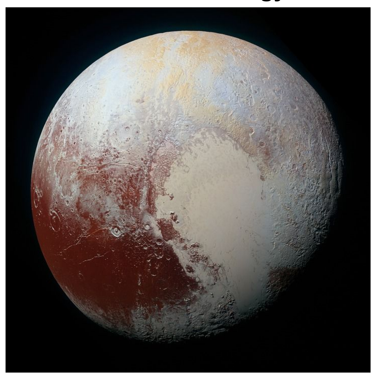
Pluto transits 12-30 years per sign. Pluto has a 248-day solar orbit through the zodiac.