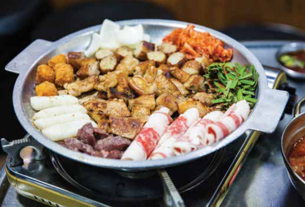
Gopchang (grilled pig or cow intestines) is a popular dish in Daegu.

The region around Busan is no exception. Daegu, a big city, is packed with restaurants of all kinds, though being an inland settlement, the focus is more on beef, pork, and chicken dishes. Gyeongju's history means you'll find more traditional choices there, including han jeongshik , a Korean court food that features up to 40 individual side dishes. And given their seaside location, the restaurants of Geoje Island and Tongyeong tend to serve fresh seafood.