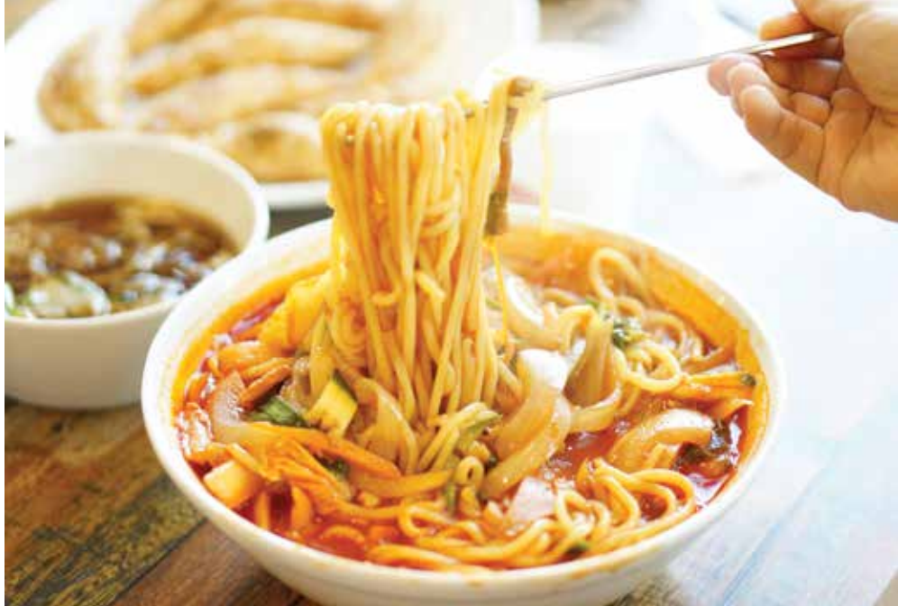
Jjambbong (noodles in spicy red broth) is a must-try dish in Tongyeong.

but also affords passengers enough time to meditate on the raw beauty of this particular corner of the country. ☎ 205 Bal-gae-ro, Tongyeong, Gyeongsangnam-do ☎ 1330 Korea Travel Helpline 🌐 cablecar. ttdc.kr 🚗 ₩14,000 (round trip).