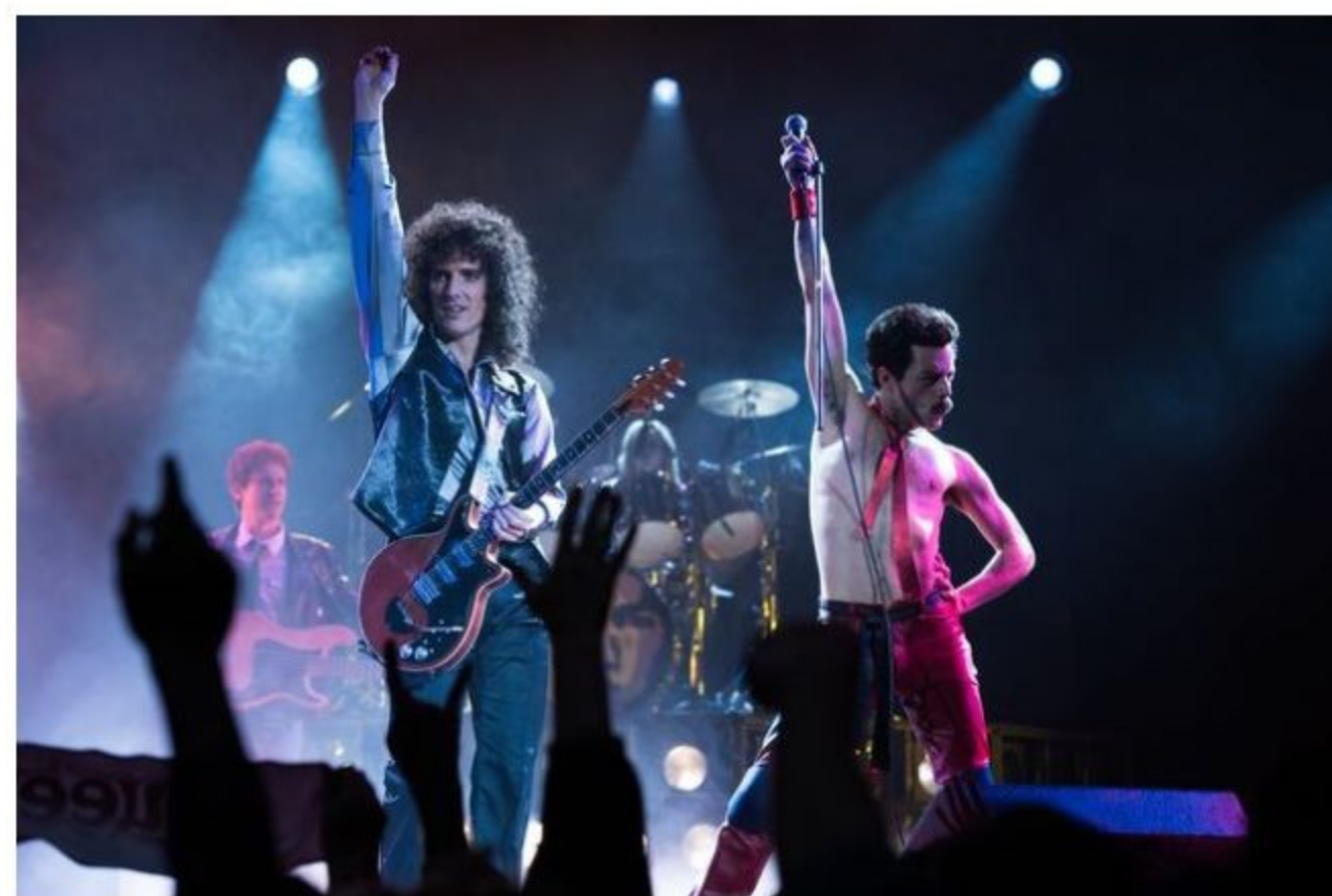
Gwilym Lee as Brian May, Rami Malek as Freddie Mercury

Iconic Queen frontman Freddie Mercury (Rami Malek) wears a black t-shirt with sun rays; a regal velvet jacket sparkling in shades of gold, purple and teal; a black wrap top; and a crystallized crown. Brian May (Gwilym Lee) rocks a black waistcoat with a crystal spider web, while Roger Taylor (Ben Hardy) sports a crystal-covered white shirt.