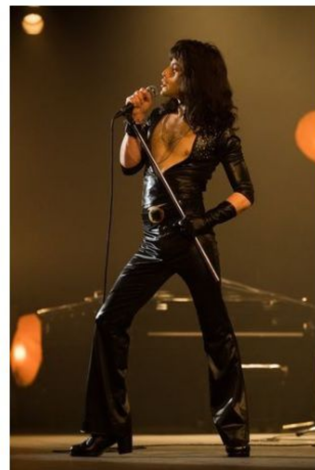
Rami Malek as Freddie Mercury, wearing a costume embellished with Swarovski crystals

Visitors can also enjoy a pop-up shop and exhibition bursting with Queen and Bohemian Rhapsody memorabilia, including film photography, prints, footage and show-stopping costumes. Also on show is a Bohemian Rhapsody film poster radiant with 14,000 Swarovski crystals to be sold in aid of the Mercury Phoenix Trust.