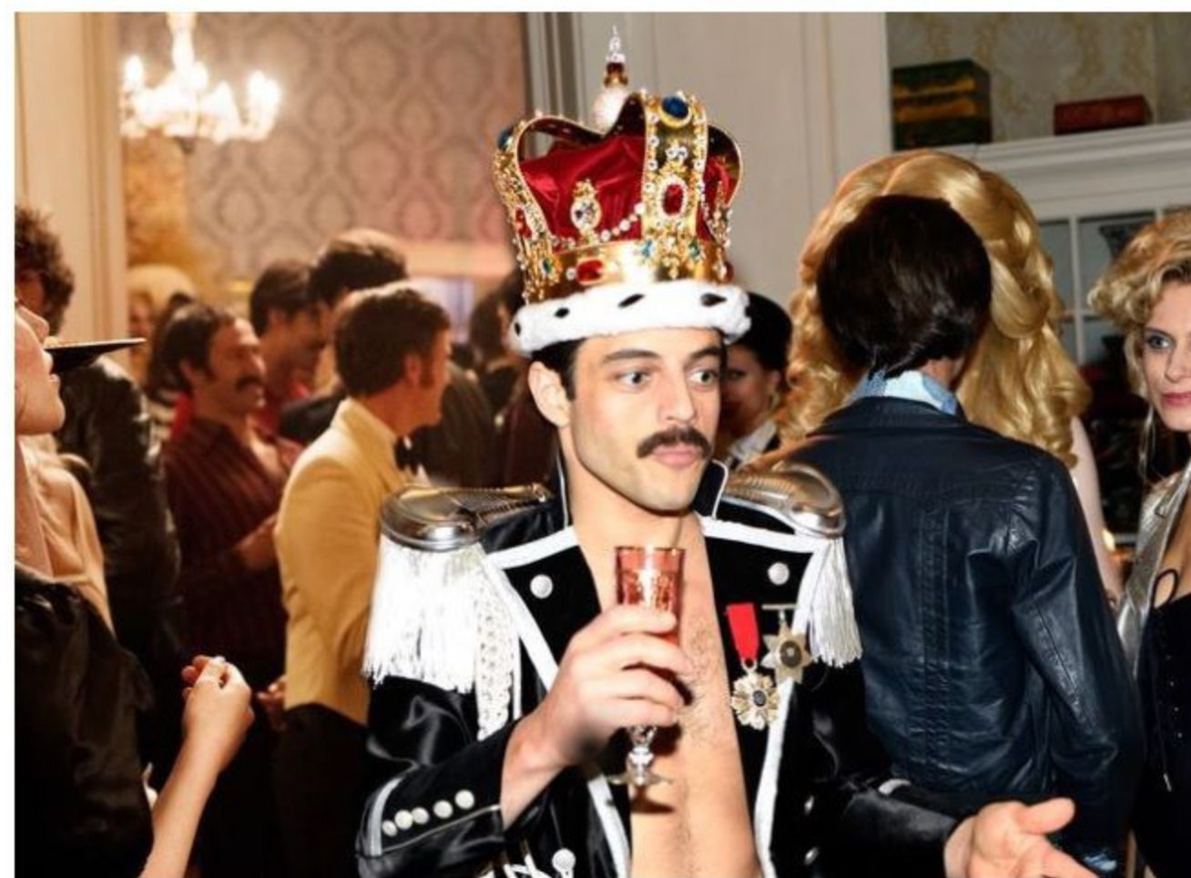
Rami Malek as Freddie Mercury

Over 56,000 Swarovski crystals dazzle throughout Bohemian Rhapsody , which chronicles the meteoric rise of Queen and their legendary appearance at the 1985 Live Aid concert.