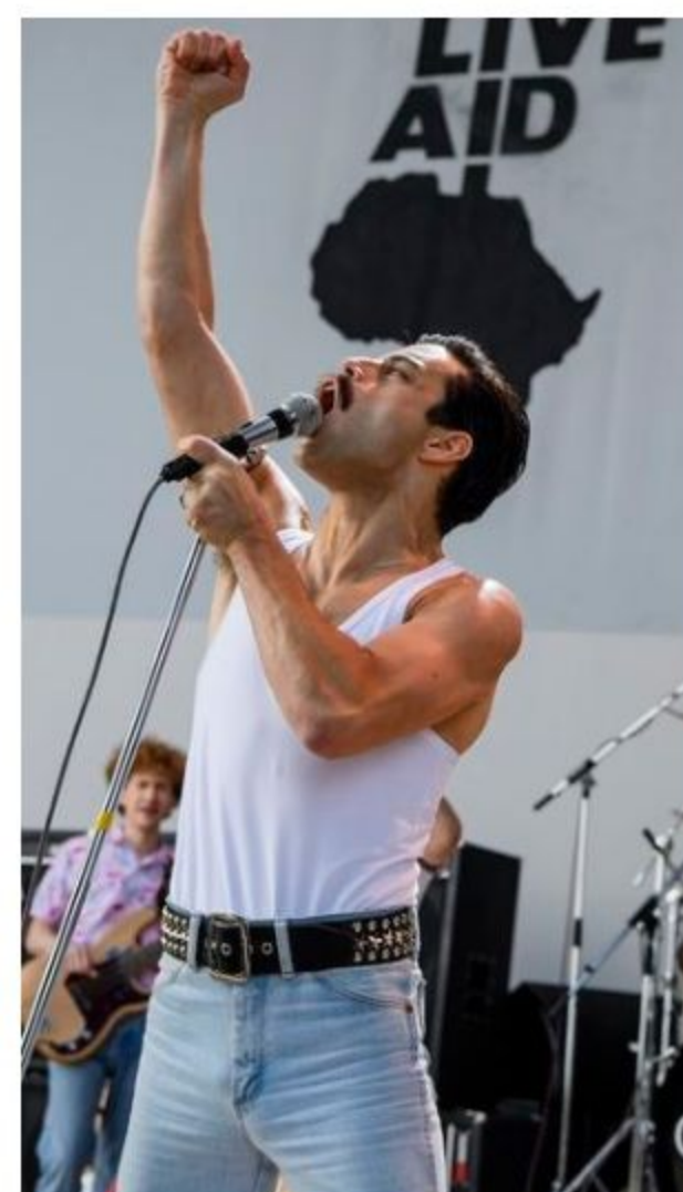
Rami Malek as Freddie Mercury, performing at the 1985 Live Aid concert