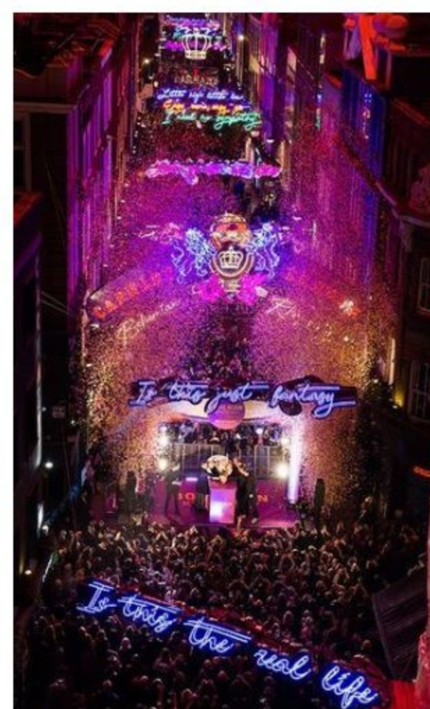
Carnaby Street lit up with themed Queen light display