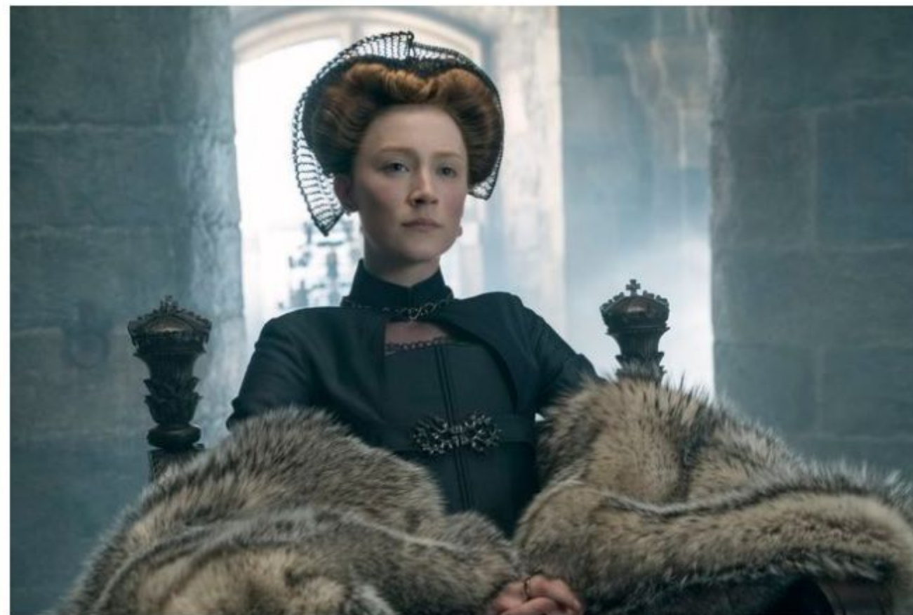
Saoirse Ronan as Mary Queen of Scots

Bespoke crystals in Black Diamond and Padparadscha colorways were also created for Byrne to recreate a dazzling crystal and pearl charm necklace worn by Elizabeth, inspired by an archive piece of the period. A variety of customized crystals were used for period jewelry and dazzling hair pieces worn by the powerful monarchs and their courtiers.