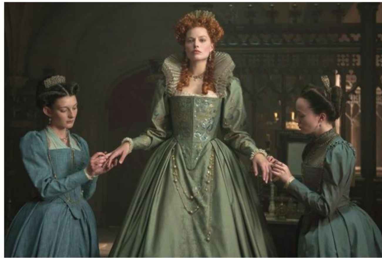
Margot Robbie as Queen Elizabeth I

Over 40,000 Swarovski crystals and Swarovski Crystal Pearls add opulence to the royal wardrobes of Mary Queen of Scots and Queen Elizabeth I in the dramatic retelling of the battle between two queens for England's throne.