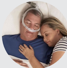
Treatment Delivered In-Home