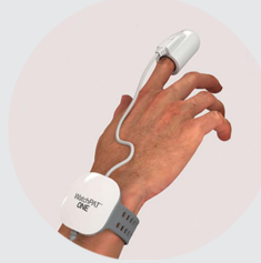
Single-Use In-Home Testing