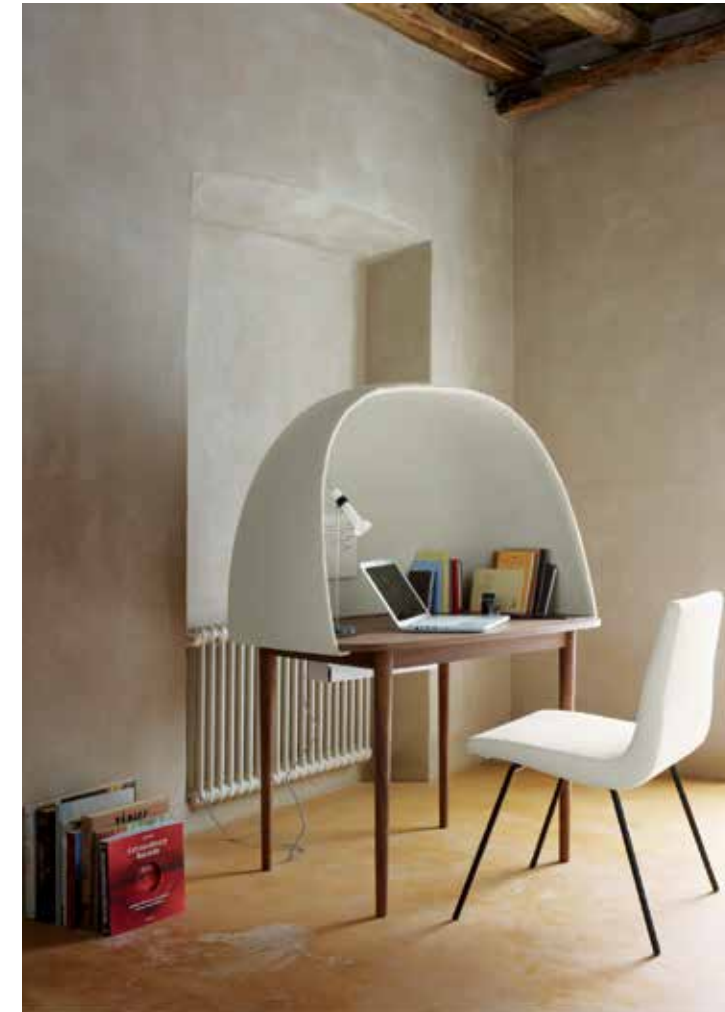
Above: Pouf or coffee table? Hard and soft meet in the Fraga in ingenious fusion. Right: The Rewrite desk creates a cozy workspace cocoon, an oasis to escape to in this forever “on,” forever connected world. Both available exclusively at LivingSpace in Vancouver.

enjoy it together, to bring home the joy of your success.” Nevertheless, he says the task is not always easy. “You need to find your own balance,” he states, mentioning they have even explored the theme in their Balance design exhibition. “There is no recipe.”