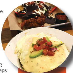
The Power Bowl at Marion Street Deli & Pub is made with fresh, cubed sweet potatoes, black beans, fresh spinach, house salsa, two organic eggs and pepper jack cheese. You can add salmon, ahi tuna, chicken, tofu or avocado.

Even their traditional southern dishes offer a new twist. The honey sriracha chicken and waffles, backyard brisket sliders and meatloaf stacks take southern food to a new level. One thing is for sure: if you're looking to try something new, make your way to Marion Street.