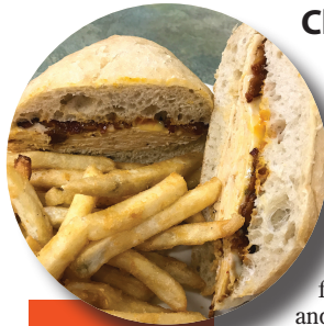
Each month Chasteen's serves up a special sandwich, like this Buffalo Club Sandwich.

Eating at Chasteen's is a right of passage for the people of Lake City. It's a down-home dining experience that you just can't get anywhere else.