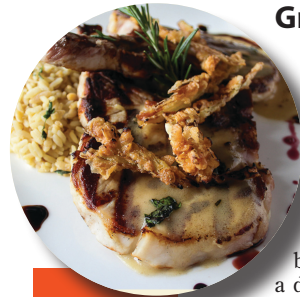
One of the Great Outdoors Restaurant's most popular dishes is the Root Beer Pork Chops, made with twin center-cut 6-oz chops, marinated in bourbon and draft root beer and smothered in bacon gravy.

If you're in the area, Great Outdoors Restaurant is a dining destination you don't want to miss.