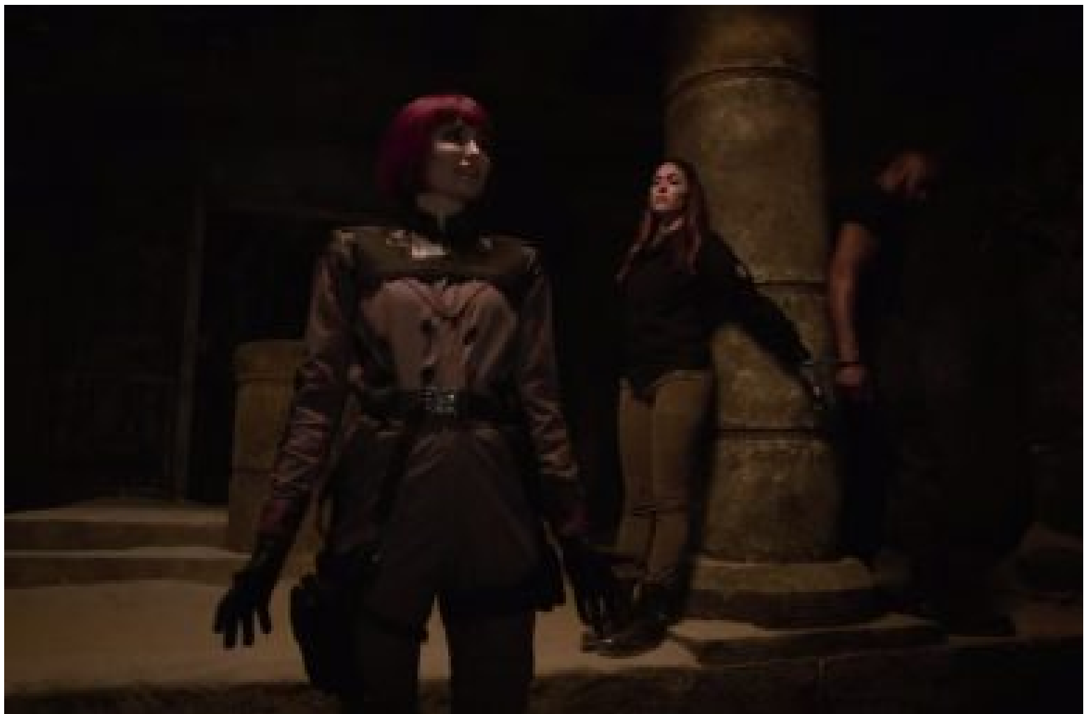
( https://mcuexchange.com/review-agents-of-s-h-i-e-l-d-season-6-episode-11/ )

REVIEW – ‘Jessica Jones’ Season 3 Episode 10 – A.K.A. Hero Pants ( https://mcuexchange.com/review-jessica-jones-season-3-episode-10/ )