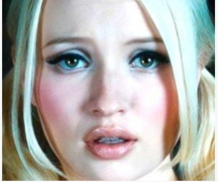
Babydoll From 'Sucker Punch' is an Absolute Bombshell Now