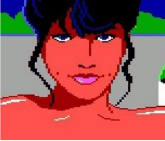
Video Games That Were Banned in America