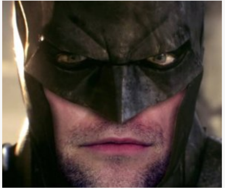
Pattinson's Struggles With 'The Batman' Keep Getting Worse