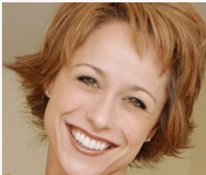
What Happened to This 'Trading Spaces' Star is Pretty Clear Now