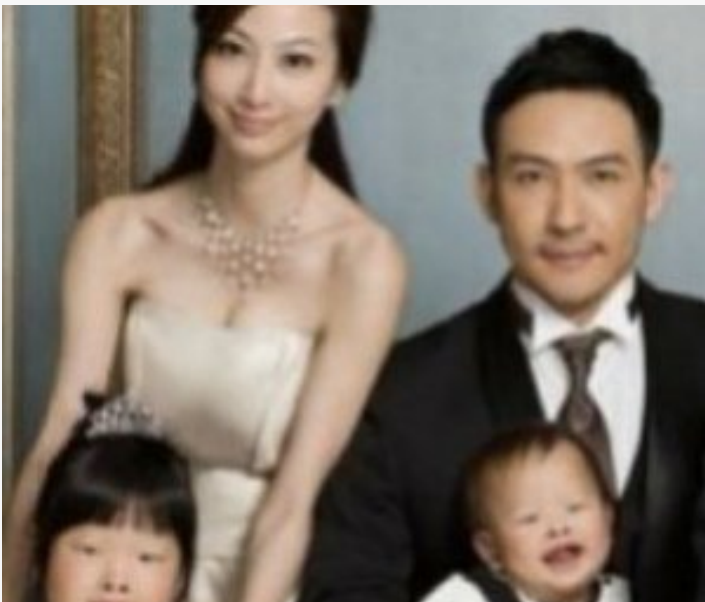
Memes That Destroyed Lives