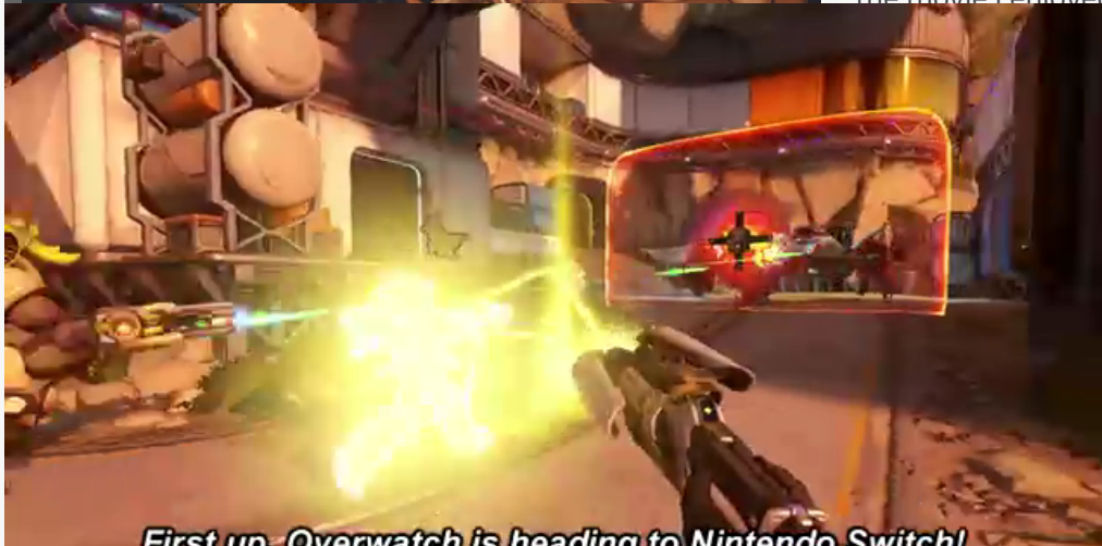
First up, Overwatch is heading to Nintendo Switch!

I don't have many regrets, but if I had one that's been kicking me for the past few months, it would be my review for Parasite . When I first saw the movie I enjoyed it, but didn't love it like most the longer I've spent away from the fact that it's been able to be very impressive. Consider this a Bong fan for life. After all, it's why that Parasite is currently