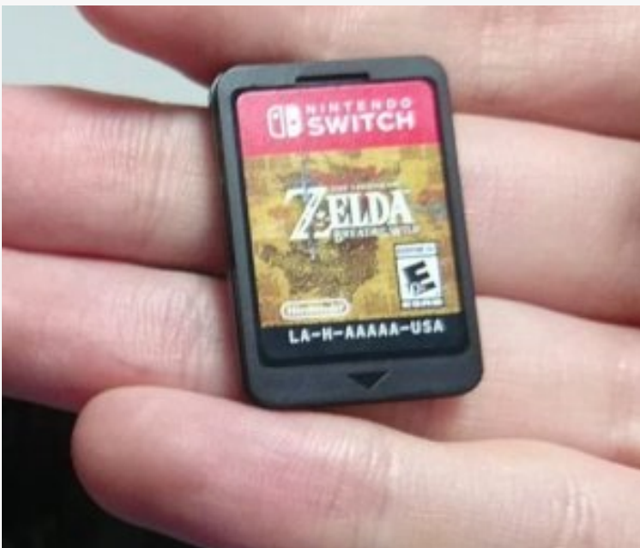
The Sad Truth About Nintendo Switch Cartridges