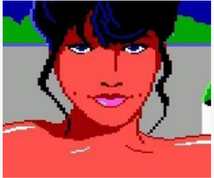
Video Games That Were Banned in America