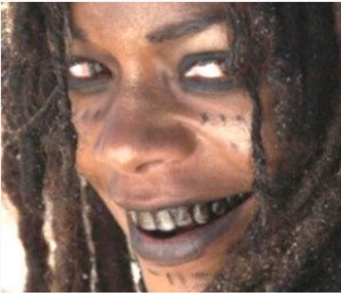
Calypso From 'Pirates of the Caribbean' is Actually a Bombshell