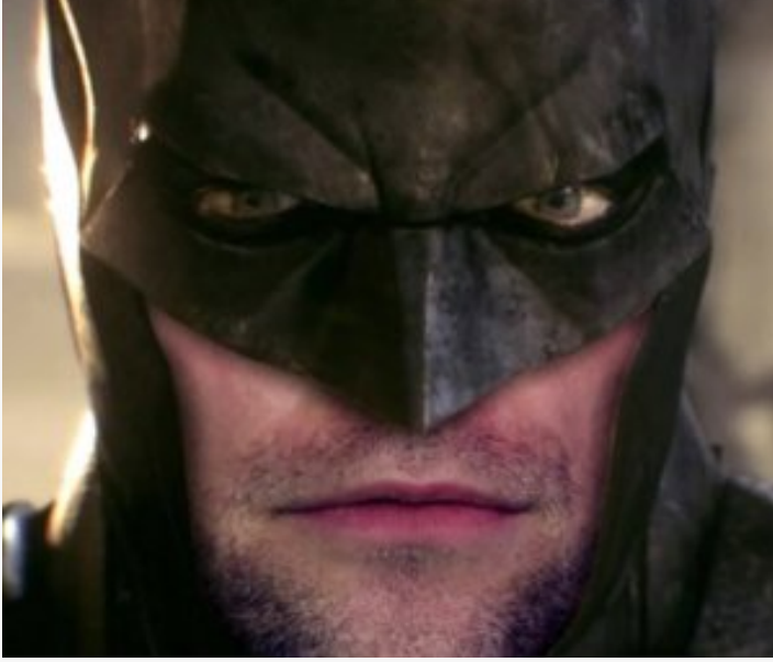
Pattinson's Struggles With 'The Batman' Keep Getting Worse