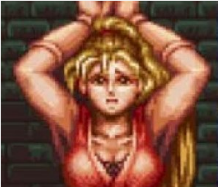
Gaming's Most Brutal Continue Screens