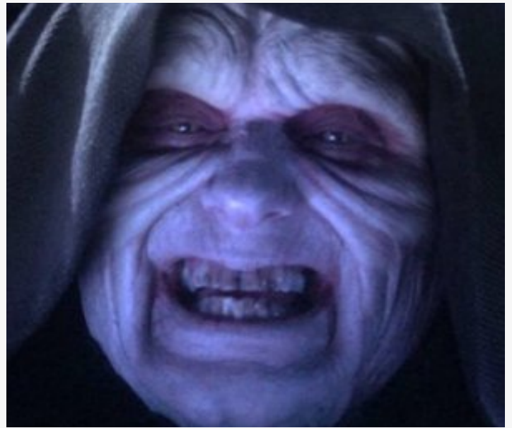
George Lucas Was Reportedly Angry About Palpatine's Return