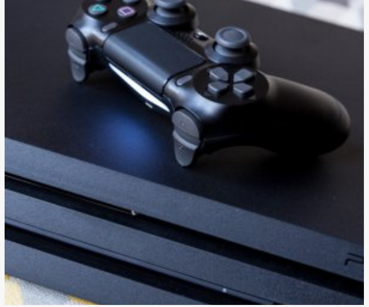
US Video Game Revenue Amount Has Gotten Astronomical