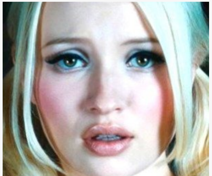
Babydoll From 'Sucker Punch' is an Absolute Bombshell Now