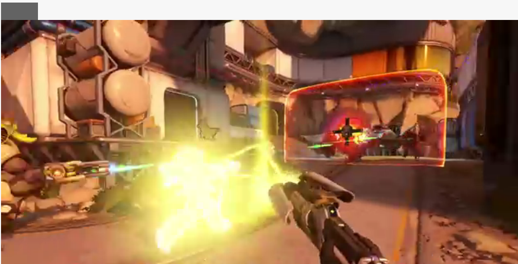
First up, Overwatch is heading to Nintendo Switch!

structoid. They are a massive MCU fan who also . more + disclosures