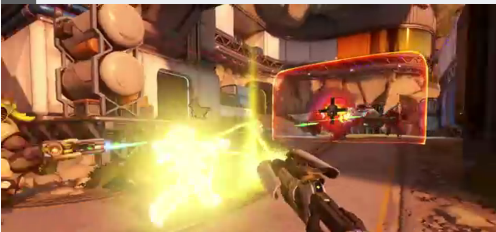
First up, Overwatch is heading to Nintendo Switch!