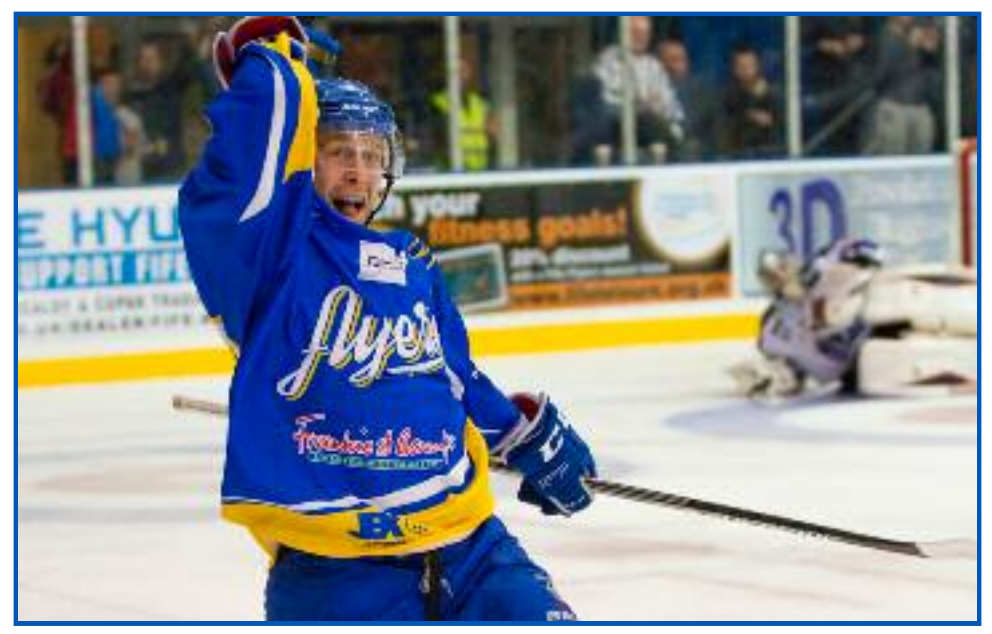
how felt. I remember longing of that team atmosphere again.