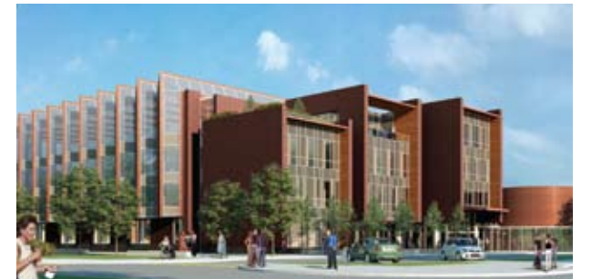
Artist rendering of new academic facility

The construction of the Athletics and Wellness Centre will transform the DEL Gym into a fully-equipped modern facility, which will give our students, staff, alumni and local residents a place to pursue their recreational, athletic and therapeutic needs.