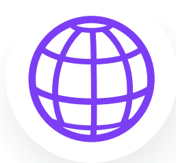
5. Manage from Anywhere