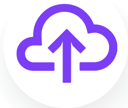
1. Import Invoices