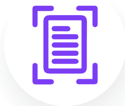
2. Capture data