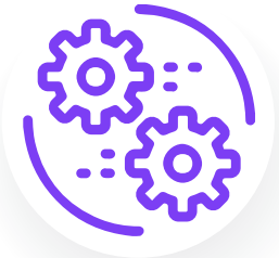
4. Post Invoice to ERP