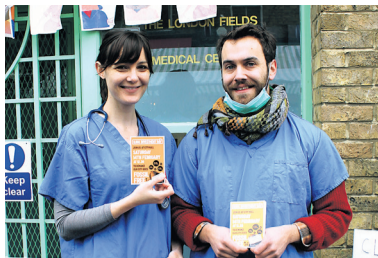
Divest Hackney page 8