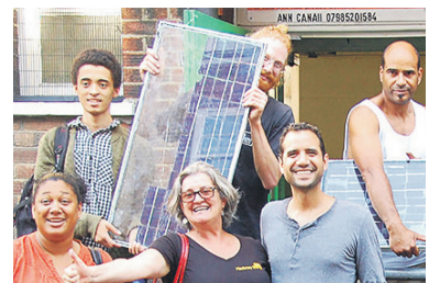
Solar start-up page 29