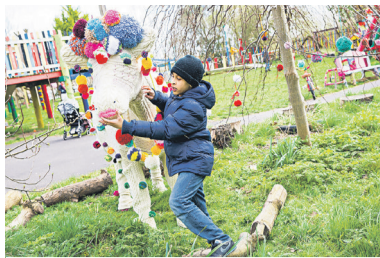
Wrapped in wool page 3