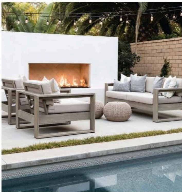
Opposite page and above: During the pandemic, many homeowners have been investing in upgrading their patios, like these designed by Pure Salt Interiors.

Revamping your patio isn’t just a good idea from a lifestyle