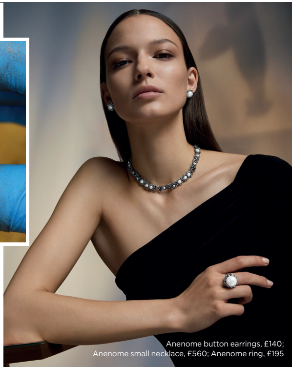
Anenome button earrings, £140; Anenome small necklace, £560; Anenome ring, £195