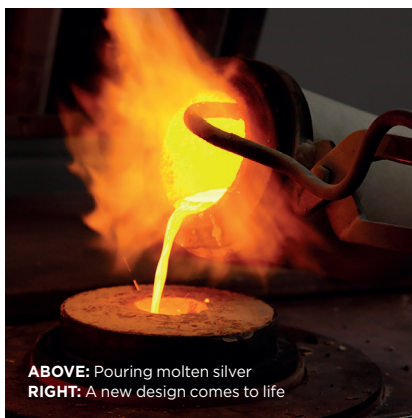
ABOVE: Pouring molten silver RIGHT: A new design comes to life