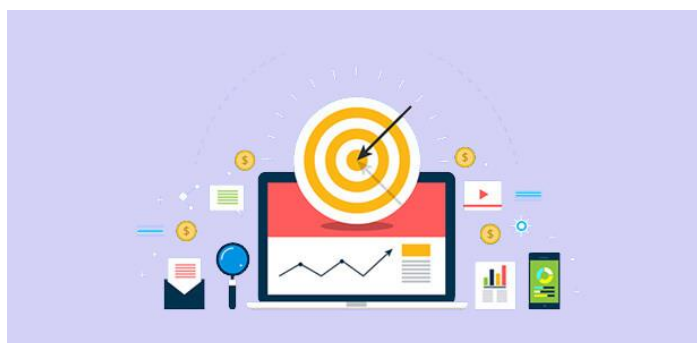
Figure 1 Content Marketing Strategy