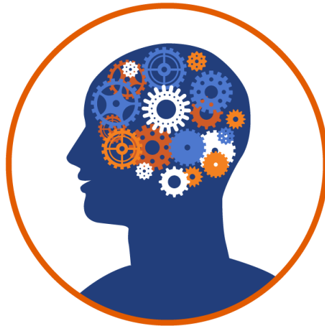
Figure 2 Content Ideation

Our team uses enhanced mind-mapping and keyword research process, therefore, they don't fall short on ideas. Stay assured that your online content will remain fueled up for months