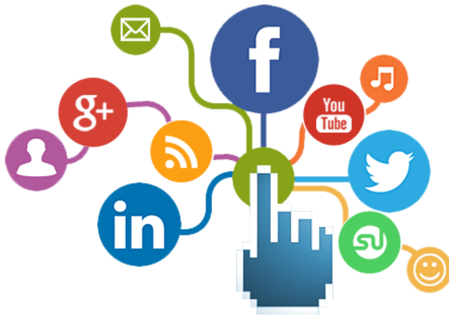
Figure 4 Content Amplification

Our SMM team knows how to distribute your content beyond your side, to the social media and other channels to spread the word.