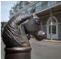
Bourbon Orleans Hotel Countless ghost sightings have been reported at this historic hotel in the French Quarter. bourbonorleans.com