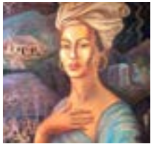
Historic Voodoo Museum Learn about Marie Laveau, the “Voodoo Queen of New Orleans,” and discover the religion’s ancient rituals here. voodoo-museum.com

Looking Back Other havens of old New Orleans