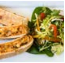
Loews New Orleans Hotel Modern Creole dishes, like a pressed crawfish po’boy, turn heads at Café Adelaide. loewshotels.com