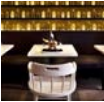
W New Orleans – French Quarter SoBou has earned accolades for its cocktails, but don’t overlook the food. Exhibit A: yellowfin tuna cones with pineapple ceviche. wfrenchquarter.com