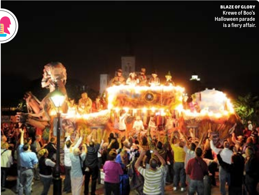
BLAZE OF GLORY Krewe of Boo’s Halloween parade is a fiery affair.