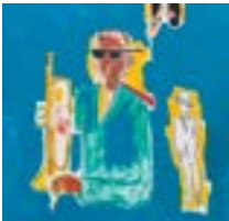
Prospect.3 Kicking off October 25, this city- wide celebration of art brings works from estab- lished and contemporary artists to about 15 venues around town. prospectneworleans.org