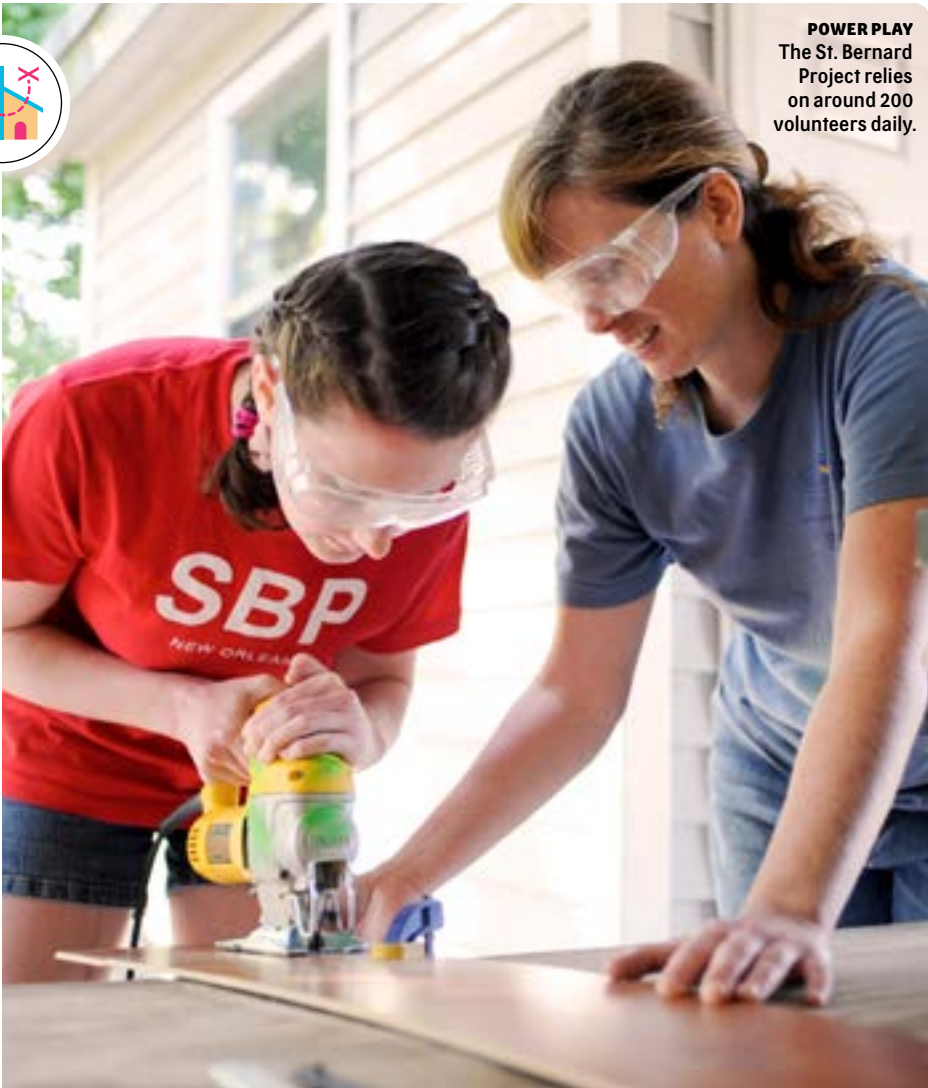
POWER PLAY The St. Bernard Project relies on around 200 volunteers daily.