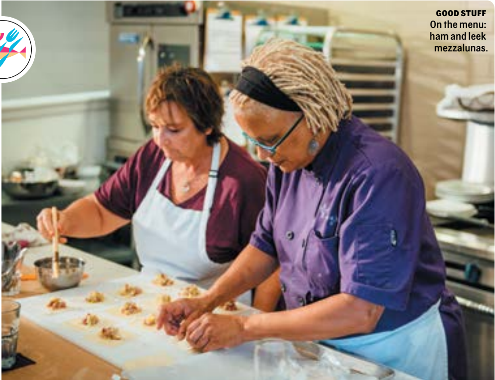
GOOD STUFF On the menu: ham and leek mezzalunas.

Milkfish This beloved Filipino pop-up finally has a permanent home in the Mid-City neighborhood. milkfishnola.com Oxalis Order the cauliflower steak, and settle into conversation at a communal table inside this Bywater gastropub. oxalisbywater.com District On Magazine Street , coffee and donuts get the gourmet treatment. Try the maple Sriracha. donutsand sliders.com