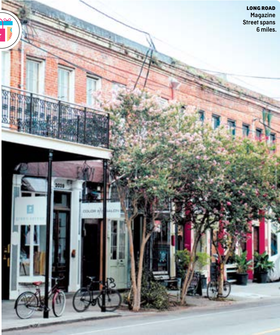
LONG ROAD Magazine Street spans 6 miles.