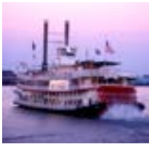
Steamboat Natchez Riverboats have navigated the Mississippi River since antebellum times. Board this cruiser for a dinner jazz excursion. steamboatnatchez.com