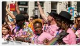
6 November 2023 2024 events in Amsterdam