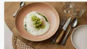
1 June 2023 Restaurants and bars in De Plantage