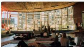
2 August 2023 Art and culture in Nieuw-West