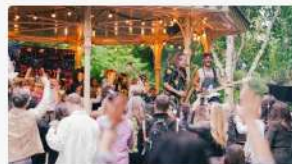
3 August 2023 5 reasons to visit ARTIS Summer Nights