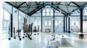
19 September 2023 Best contemporary art spaces in Amsterdam