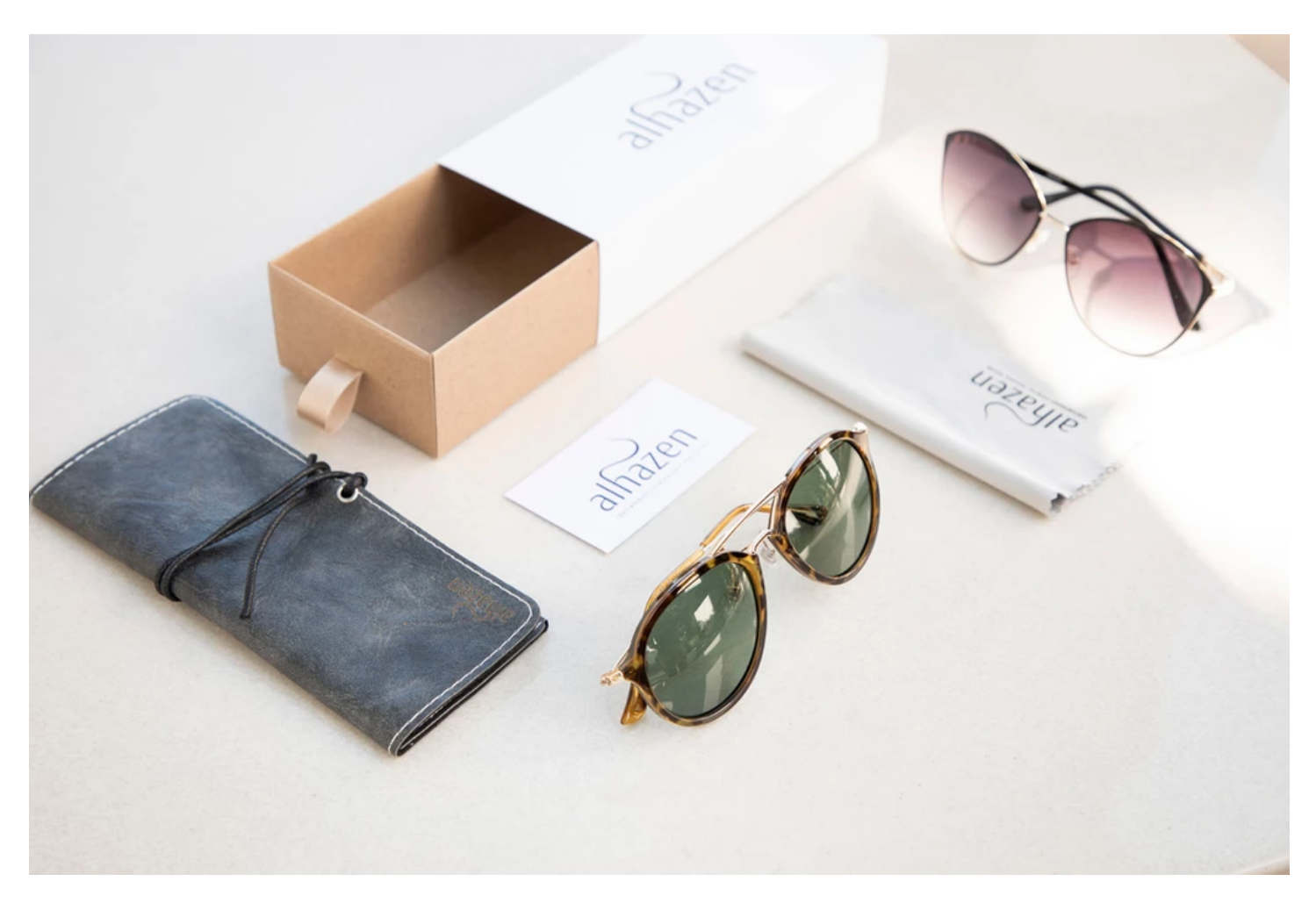
Contemporary eyewear. Inspired design.

Offering free shipping in South Africa, we look after every detail — meticulously. Your pair of authentic Alhazen Eyewear sunglasses is individually packed with our branded touch. Each pair is also accompanied by its own pouch and microfibre cleaning cloth — both stamped with the Alhazen Eyewear flourish. It's a complete experience.