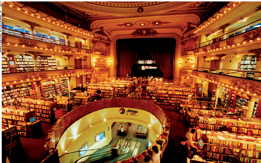
BOOKS ARE THE STAR ATTRACTION AT LIBRERIA EL ATENEO GRAND SPLENDID, BUENOS AIRES, ARGENTINA

The Bookworm does everything a good bookshop should do – which is a lot more than sell books. The Beijing mothership, which has spawned branches in Suzhuo and Chengdu, has played a huge role in promoting both local and foreign literature. Not only is it one of the few places in China where you can pick up books which are banned in the country,