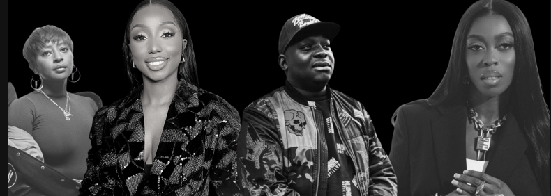
Black History Month: Creatives Making Moves In The Music Industry