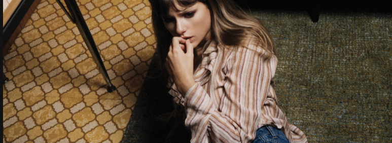
Taylor Swift's Modern-Classic Hit: Midnights Review