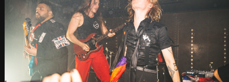
Boy Bleach's London Debut At The Camden Assembly