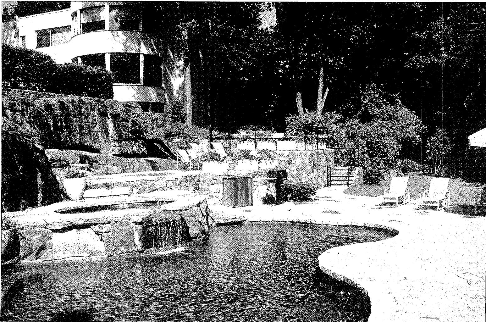
Lisa Rosenfeld replaced her conventional pool with a natural stone environment that includes an integrated waterfall and a hot tub that is part of the pool.