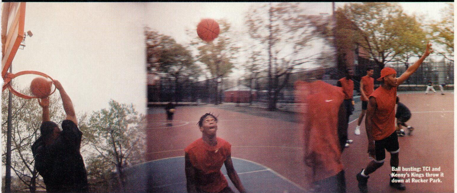
Ball busting: TCI and Kenny's Kings throw it down at Rucker Park.

Divisions Unlimited, college and high school; NCAA-sanctioned. ■