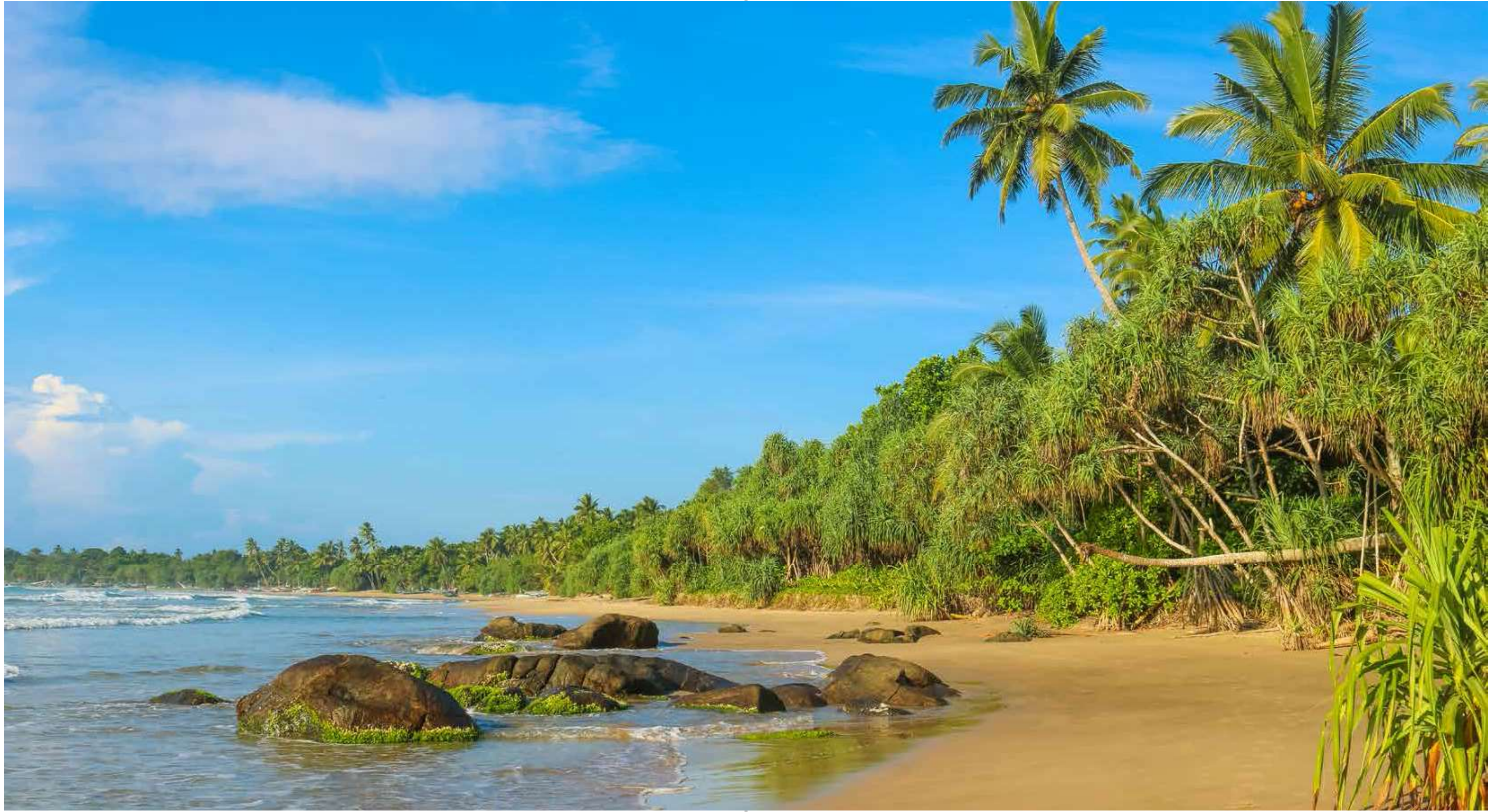
Mawella's Paradise Beach