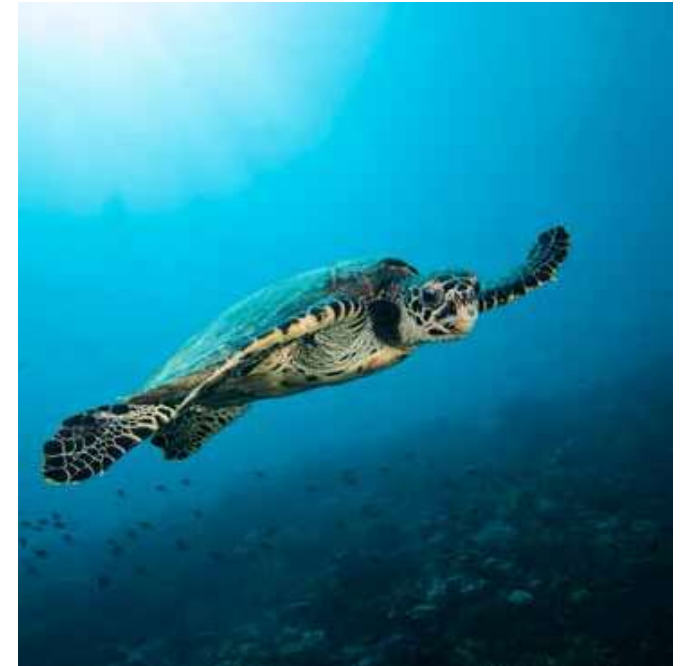
Dive For Good

1-Day or Multi-Day Community Aid Sports Tours organised for international teams in men's cricket and women's cricket & netball. On a non-match day, visiting teams can take part in special community outreach activities such as beach cleaning, visiting elders' homes, teaching English, painting classrooms and various other activities.