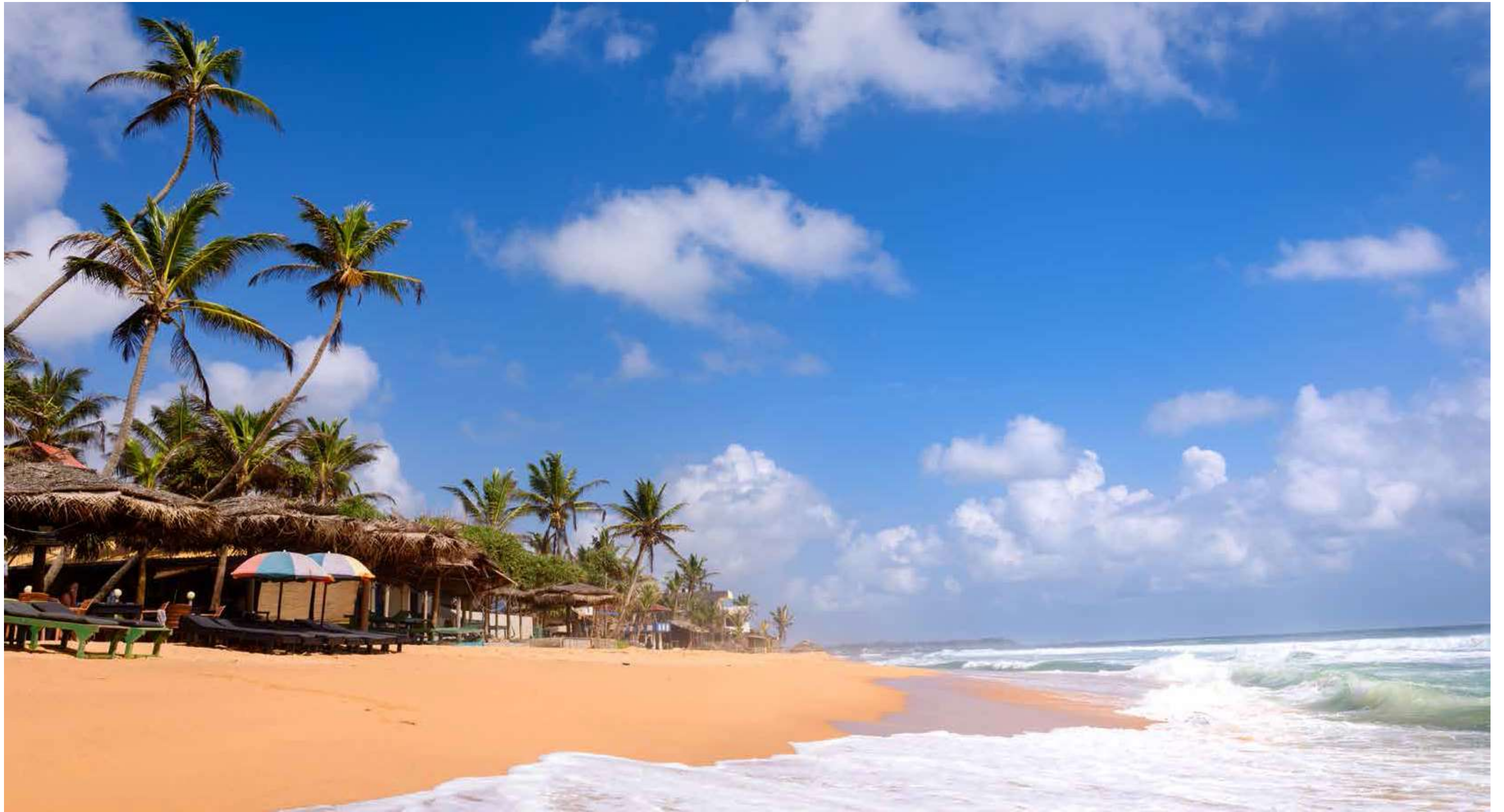
Beach Bars in Hikkaduwa