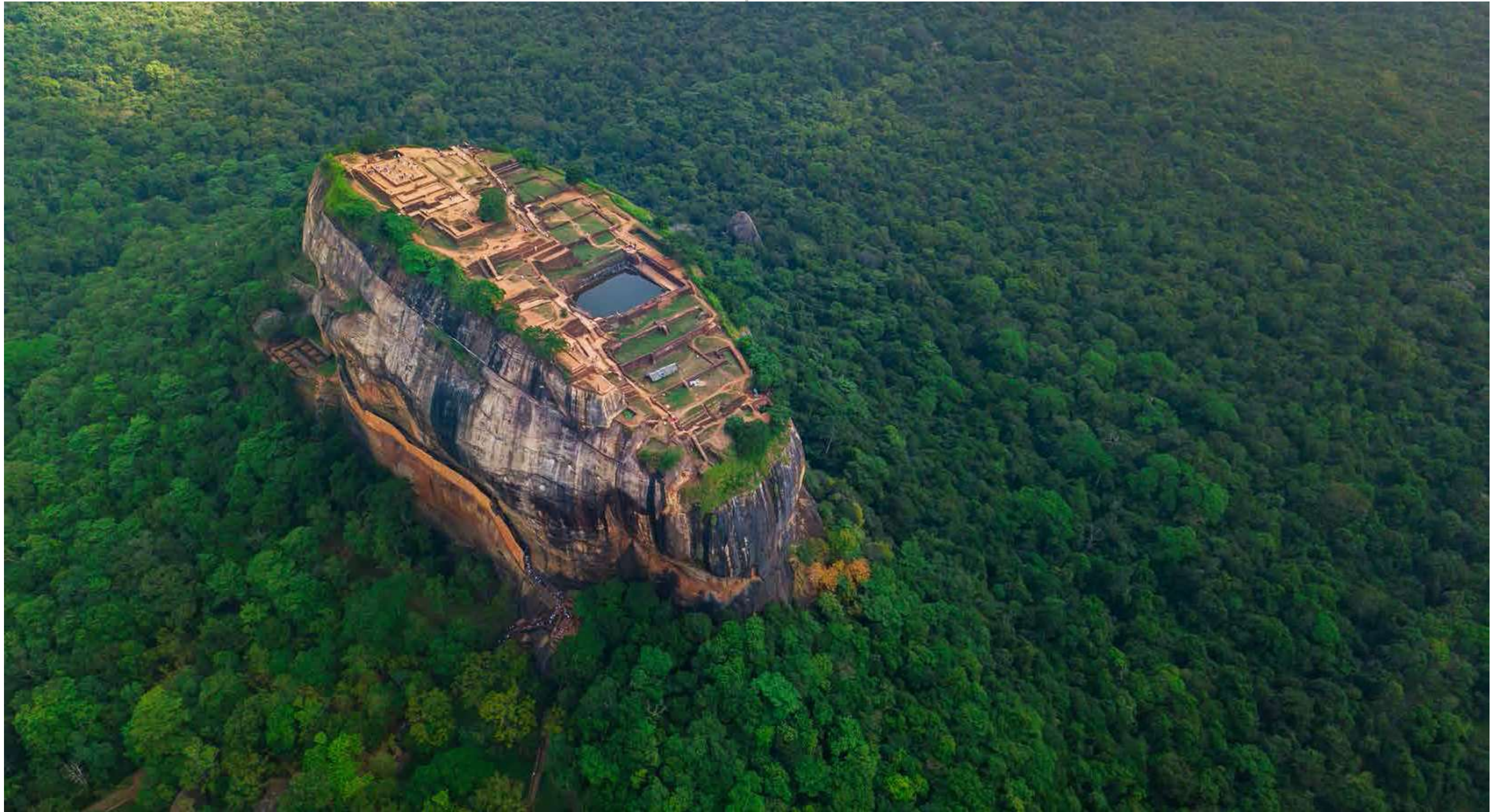
Sigiriya – The ruins of the capital city built by King Kassapa I (477–95) lie on the steep slopes and at the summit of a granite peak standing some 180m high