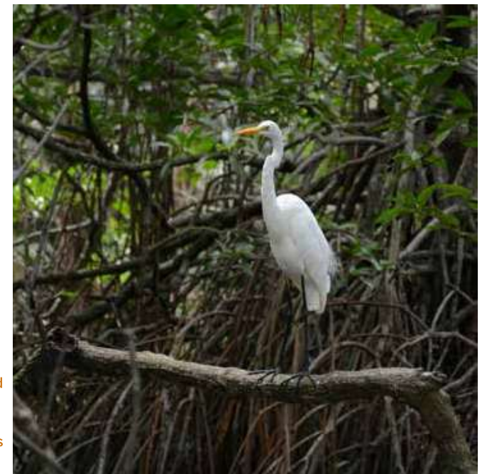
Goodness Nature Cruise Hikkaduwa Lake