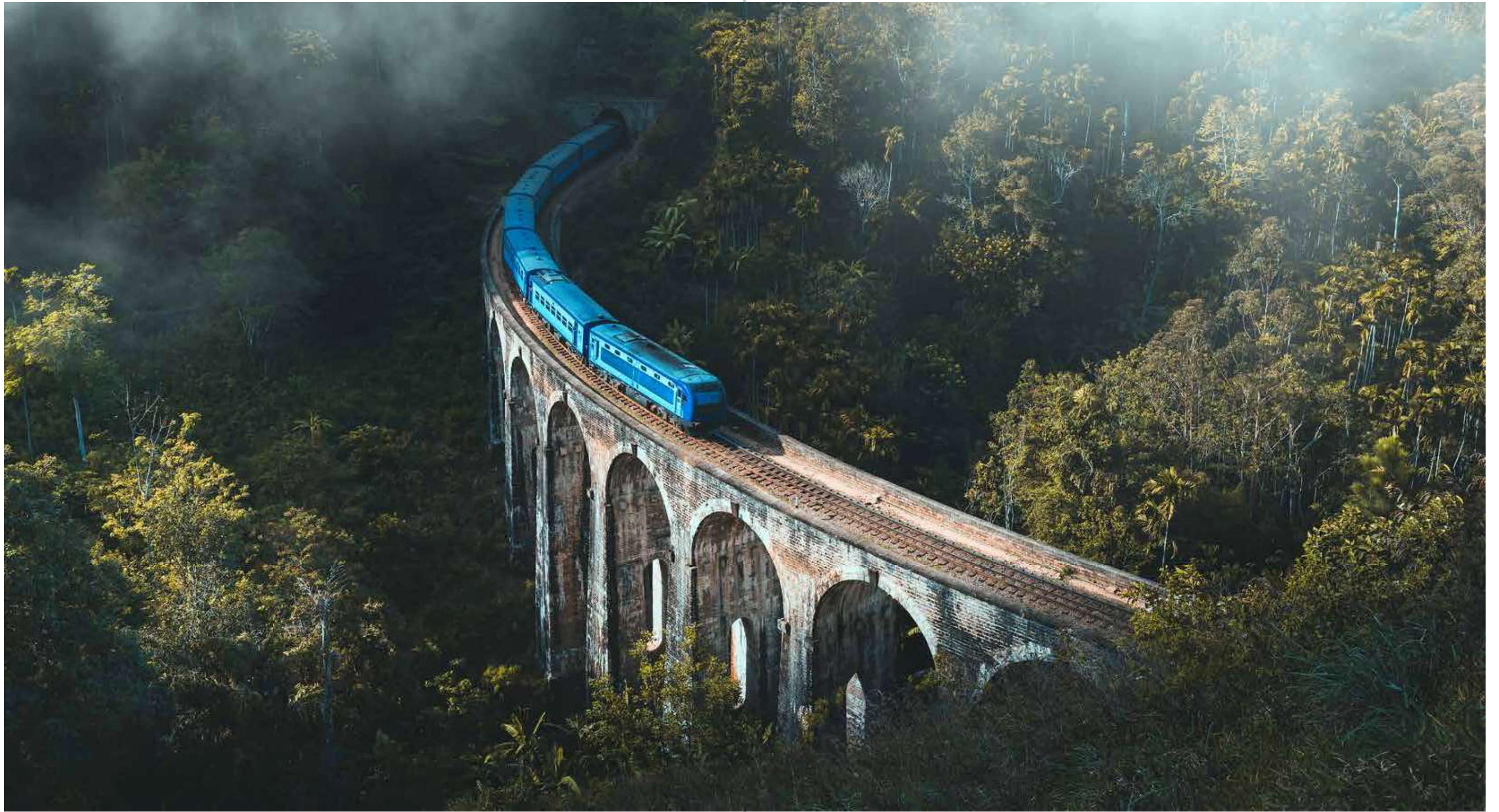
Travelling over the Nine Arch Bridge in Ella on the Kandy-Ella train route, often referred to as the most scenic train ride in the world