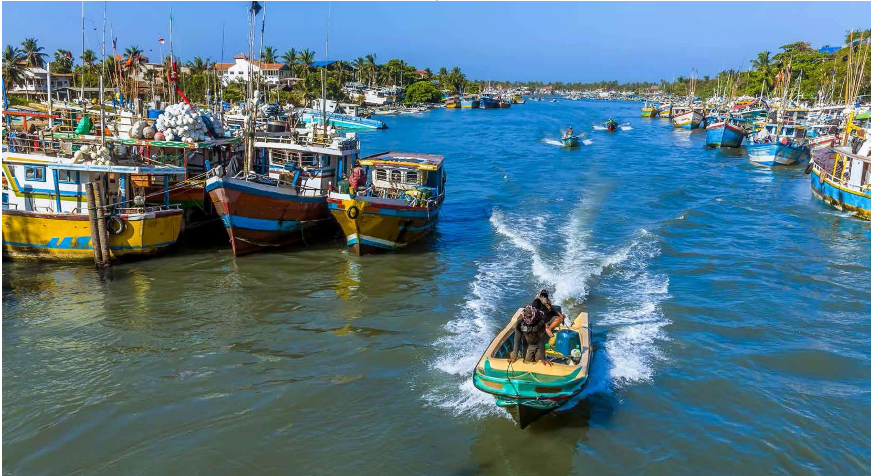
Fishermen landing their catch in the lagoon in Negombo