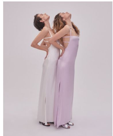
The Ellie Dress $229

The Summer Party Collection by Fame and Partners X Say Lou Lou gives you all the summer party outfits and dancing inspiration you need to get started.