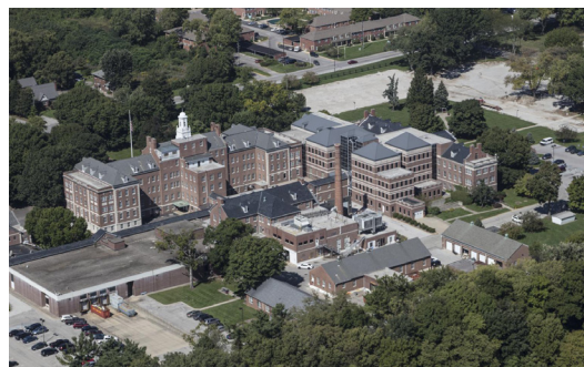
Aerial view of the Larue D. Carter psychiatric hospital complex in Indianapolis, Indiana. United States Indiana Indianapolis Marion County, 2016. -09-19. Photograph. https://www.loc.gov/item/2016631665/.

The vision for REID will breathe new life into some of the most historic structures on the property, using them as a hub for improving educational attainment in partnership with residents of the NNW.