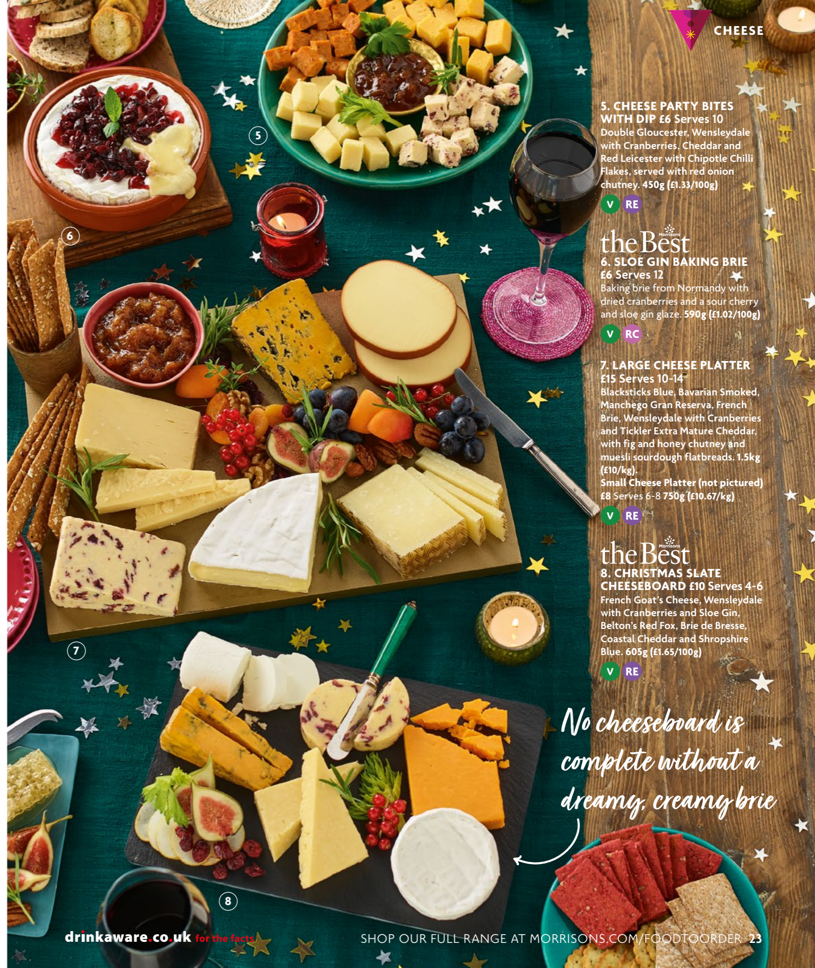
5. CHEESE PARTY BITES WITH DIP £6 Serves 10 Double Gloucester, Wensleydale with Cranberries, Cheddar and Red Leicester with Chipotle Chilli Flakes, served with red onion chutney. 450g (£1.33/100g)