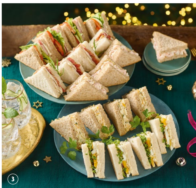
1. SPICY SNACKS PLATTER £8 35 pieces. Serves 8-10 Prepared in store with 10 onion bhajis, 10 chicken pakoras, 5 vegetable spring rolls, 5 vegetable samosas, 10 Cantonese satay skewers and 5 vegetable pakoras, plus a sweet chilli dip and a pakora dip. Large Spicy Snacks Platter (not pictured) £15 100 pieces. Serves 20-25