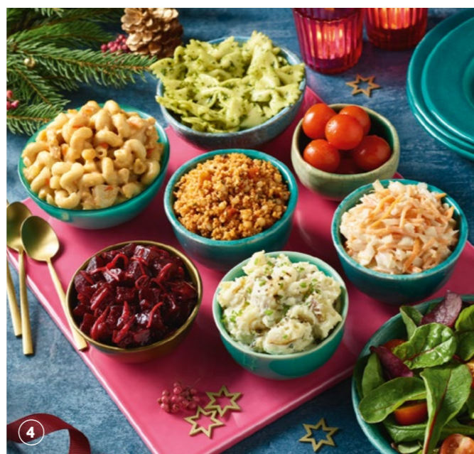
3. CLASSIC SANDWICH PLATTER £8 20 pieces. Serves 6-8 Fillings may vary but are likely to include ham salad, chicken & bacon, prawn mayo, three cheese & onion, and egg & watercress. Meat Sandwich Platter (not pictured) £8 20 pieces. Serves 6-8 Vegetarian sandwich platter (not pictured) £6 20 pieces. Serves 6-8