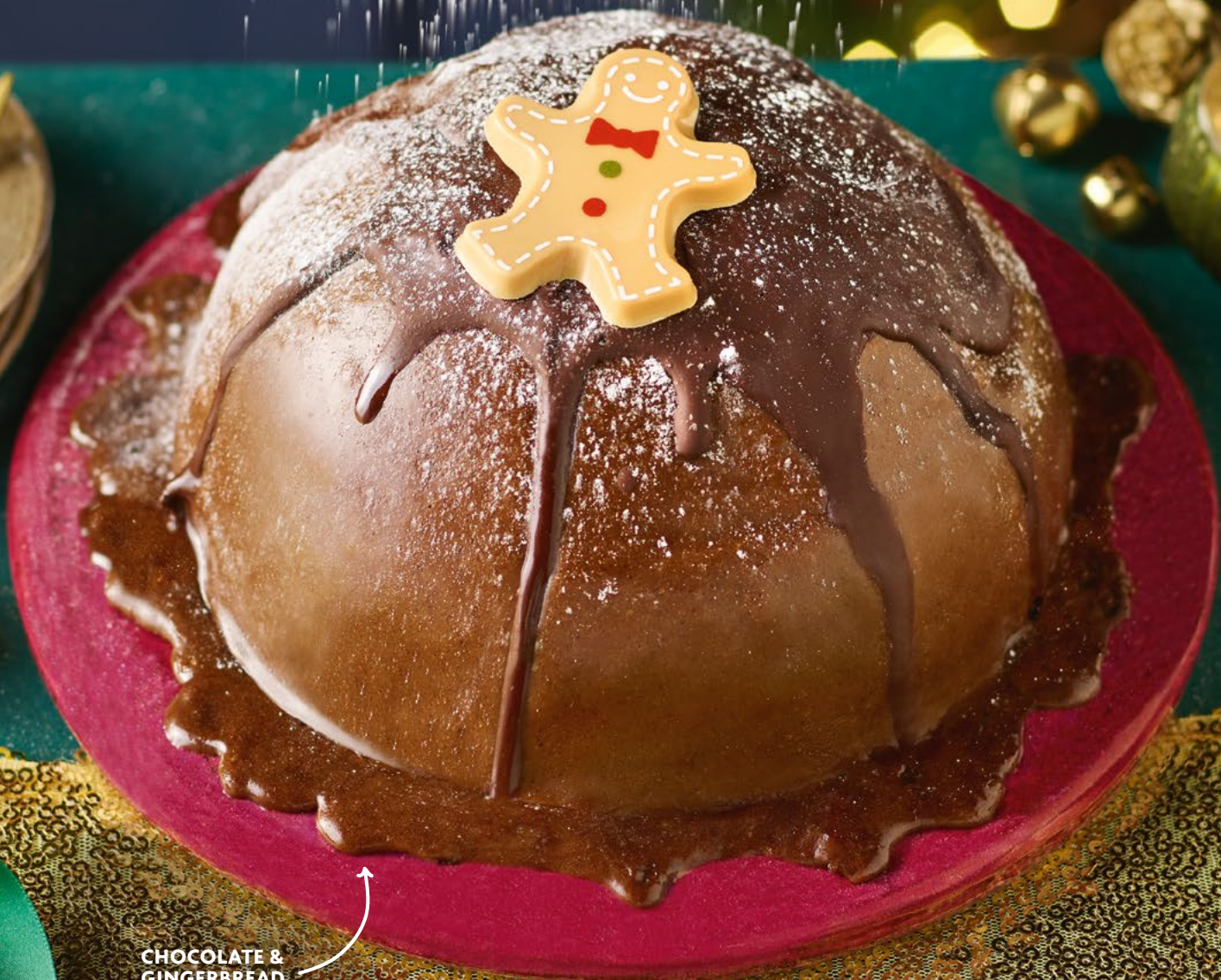
CHOCOLATE & GINGERBREAD BOMBE £7