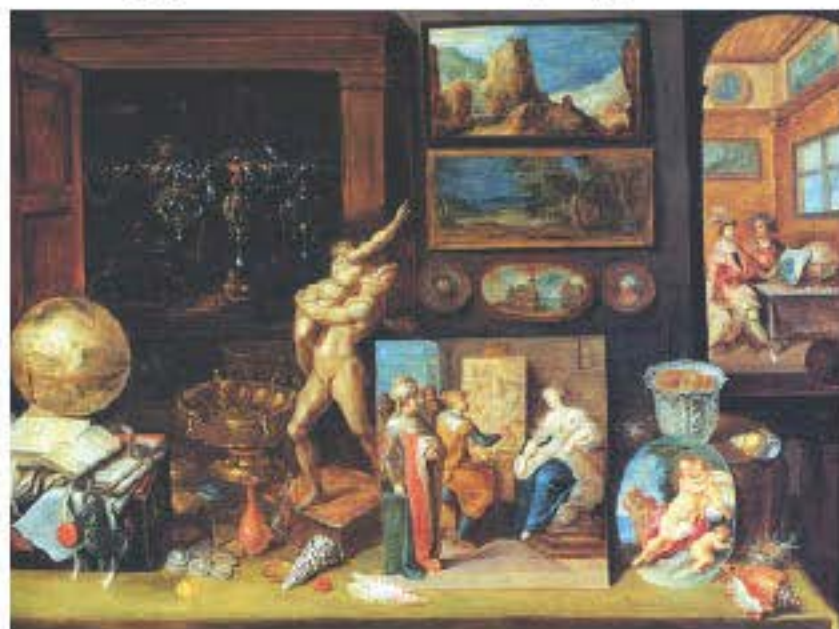
Frans II Francken (1581-1642), Chamber of Curiosities , 1636 (Vienna, Kunsthistorisches Museum)

The art museum as we know it today is a direct descendant of the so-called “Cabinet of Curiosities,” which emerged in the Renaissance. Such collections were assembled by society’s cultural elite and featured wonders from both the natural and the man-made worlds ( naturalia and artificialia , respectively). Displayed in purpose-built spaces and designed to inspire awe while facilitating learning, these wunderkammern (or “rooms of wonders”) were understood as microcosmic representations of the universe; their contents specifically installed to reveal hidden affinities and, by extrapolation, important clues to unraveling life’s mysteries. As the illustrated frontispiece from Ferrante Imperato’s Dell’Historia Naturale (Naples, 1599) makes clear, a typical cabinet might feature taxidermied reptiles, stuffed birds, and exotic shells, together with learned texts and treatises (it being assumed that nature had as much to teach us as books).