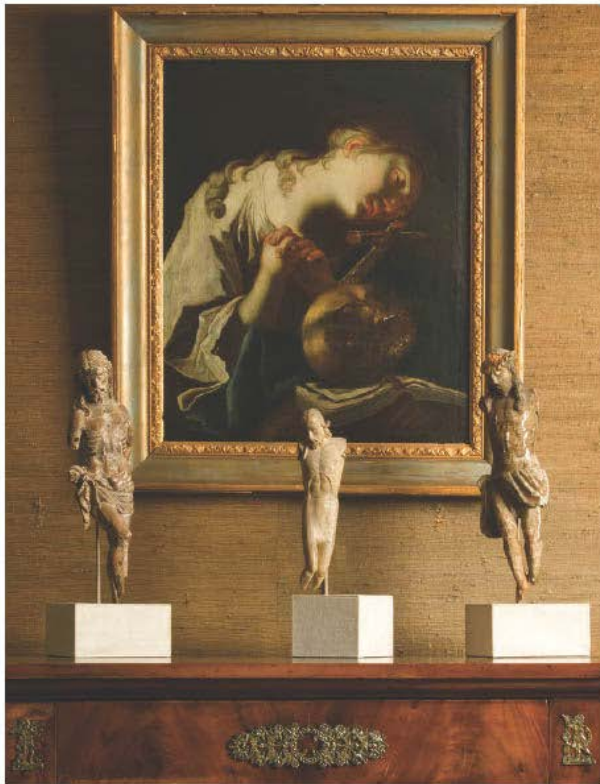
Unknown, German School, Three Antique Carved Wooden Figures of Corpus Christi , 15 1/4 x 4 1/4 x 3 1/4, 15 1/4 x 5 x 4 1/4, and 11 x 21 1/4 x 2 1/4