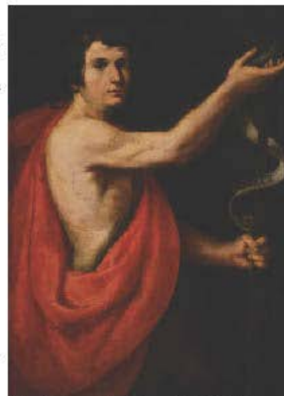
Attributed to Giovanni Baglione (Italian, ca. 1566-1643), John the Baptist , oil on canvas, 42 x 30 1/2 inches