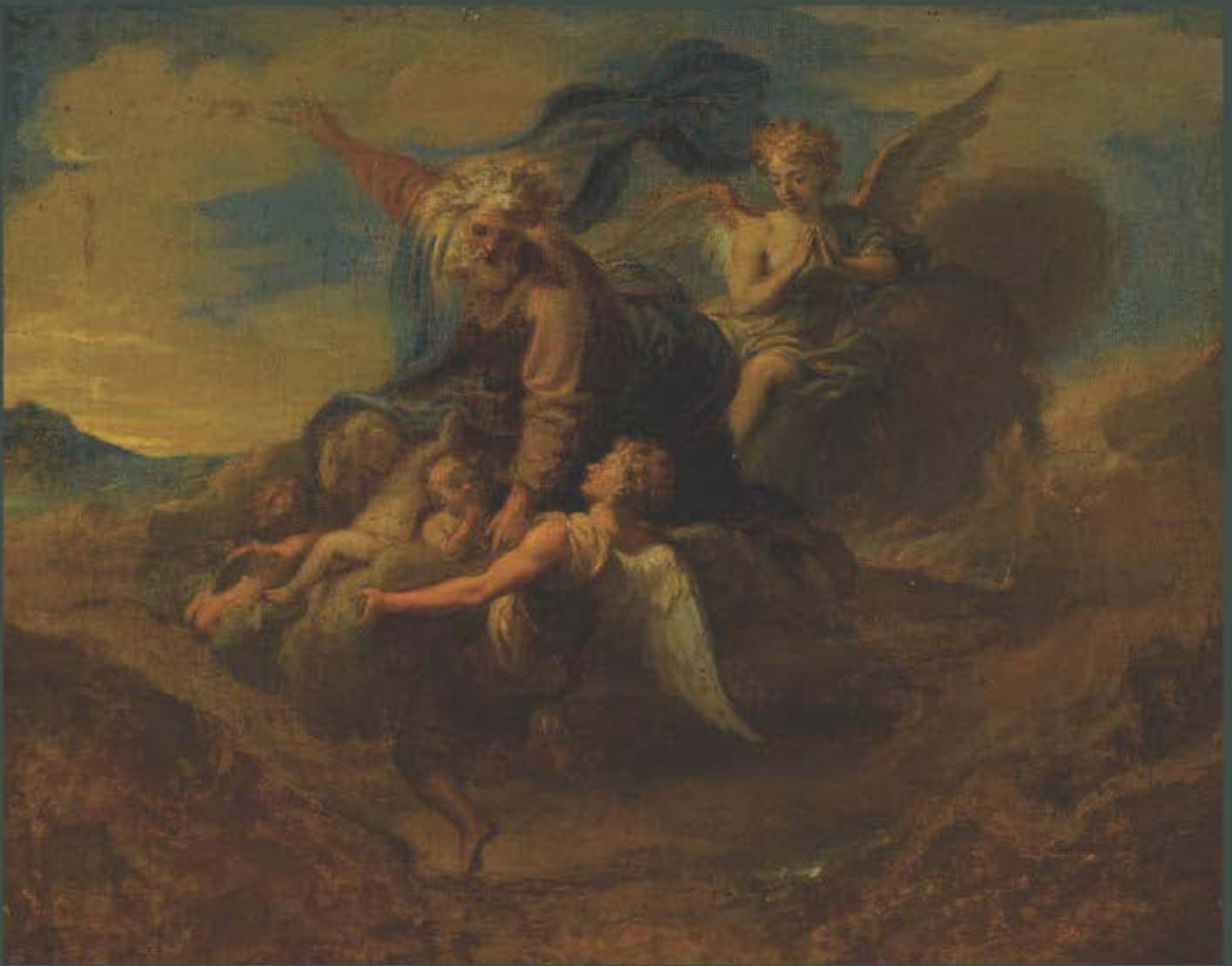
In the manner of Jean Jouvenet (French 1644-1717), Ascension , oil on canvas, 10 ¼ x 13 inches