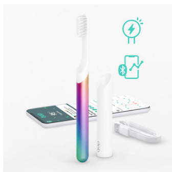
Pride Smart Rechargeable Brush Starter Kits from $60