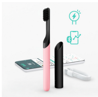
Smart Rechargeable Electric Toothbrush Remix Starter Kits from $50

We don't believe in gimmicks. That's why our brushes don't include "whitening" modes, oddly-shaped ergonomic handles, and other pricey features not proven to have a significant impact on your oral care routine. What they do include are only the features you need: a built-in 2-minute timer, 3 months of battery life per charge, and a Smart Motor that automatically tracks your routine in the quip app and helps you understand how well you're brushing.