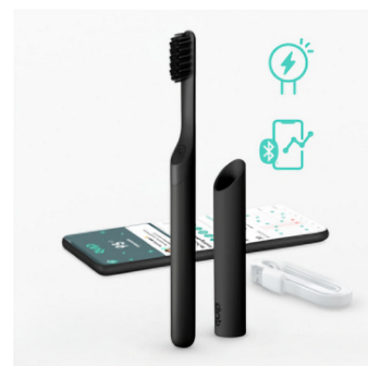
Smart Rechargeable Electric Toothbrush Starter Kits from $50