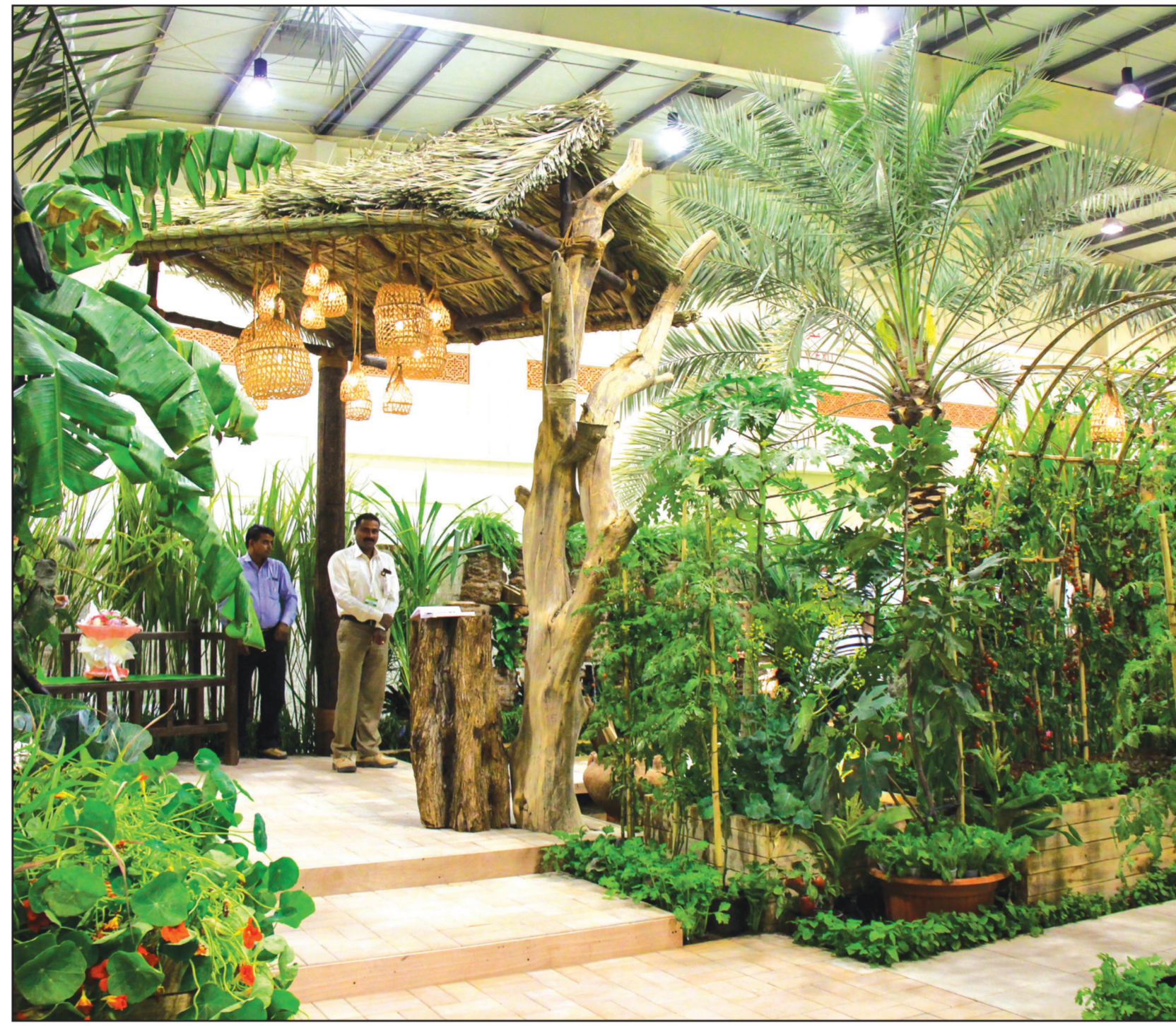
BLOOMING BLOSSOMS: Artistic creations from a vibrant garden on show at the Exhibition Centre