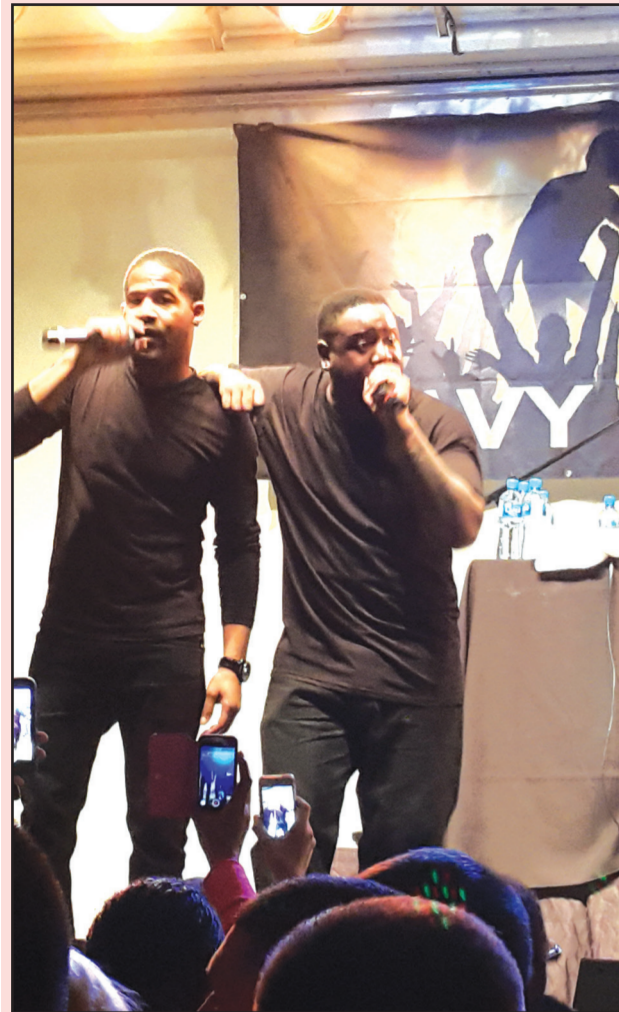
SURPRISE CONCERT: Rapper T-Pain entertains the audience